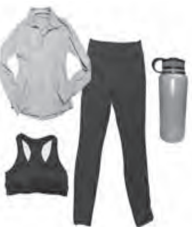
Add a pop of color to your usual black sports bra and black leggings with a work-out jacket and tumbler in dusty rose.