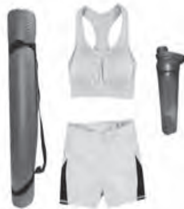
Sweat in style with a monochromatic look.