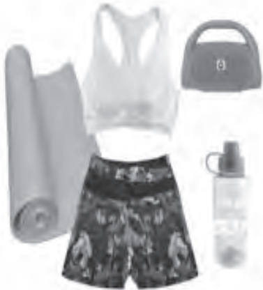
Jumpstart your routine in a white sports bra and printed shorts.

Take good care of yourself and look fit and fab with the activewear collection of Surplus. The active collection, versatile fashionable pieces and protective essentials are available in Surplus stores located in most SM Supermalls. Stay updated as Surplus goes interactive. Like them on Facebook and Twitter at SurplusPH and enjoy great fashion deals on Instagram at Surplus_ph.\