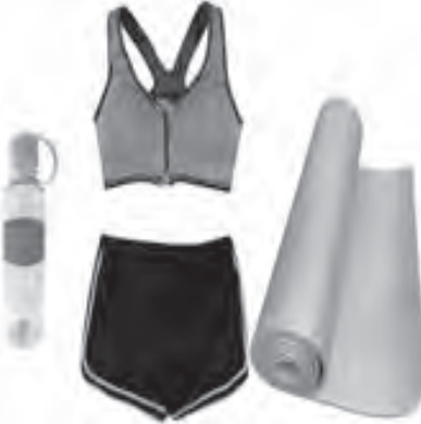
Black workout shorts + violet sports bra = elegance, energy, exercise