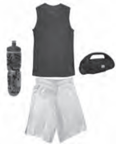
Fit and fab. A bold red top paired with some black shorts.