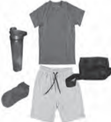
Head for the gym in a monochromatic look with a shaker bottle for your protein fix and a messenger bag for your important things.