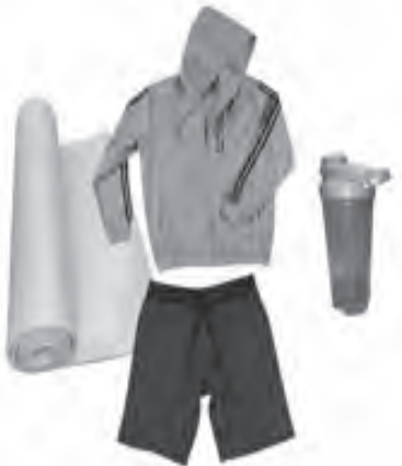
Workout wonders: a versatile jacket, neon green shaker bottle and yoga mat.