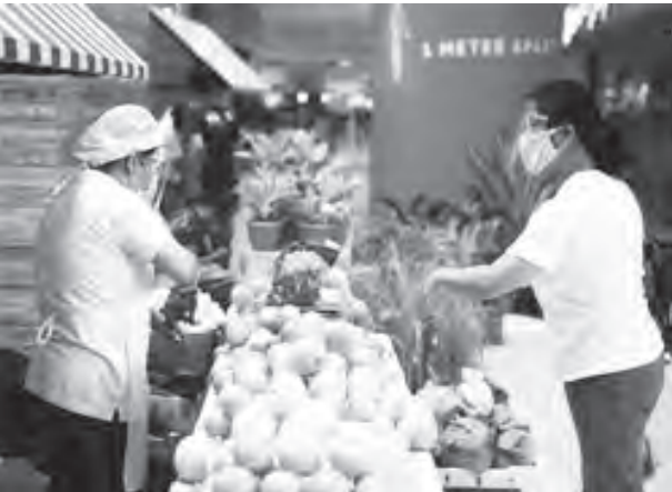
Happy garden features produce from Cavite Farmers.