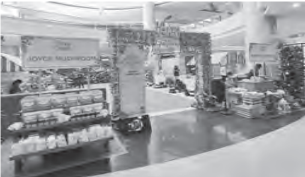
SM City Dasmariñas welcomes you to Cavite's Happy Garden!

The Cavite's Happy Garden will run from September 10 to 24 at the Annex Event Center, happening simultaneously with SM City Bacoor and SM City Molino. Visit SM City Dasmariñas Facebook and Instagram account for more details.