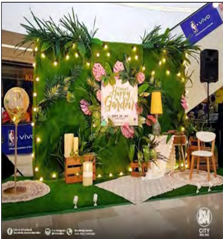
Let's go green and healthy! Check out SM City Molino Happy Garden exhibit for a wide variety of ornamental plants, herbs, and fresh produce! See you all there #plantitos and #plantitas! #iloveSMMolino #HappyGarden