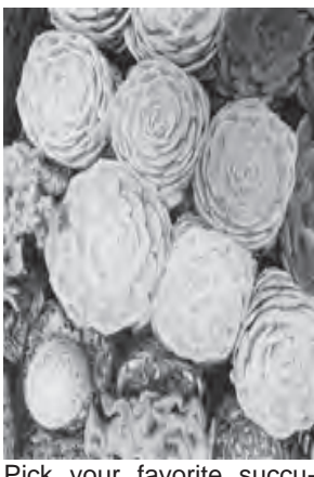
Pick your favorite succulent from the wide array of plants at Cavite's Happy Garden.