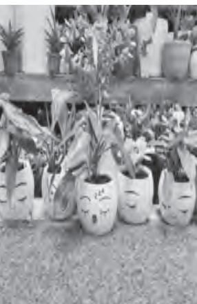
Plant pots have their own characters, too, just like plants.