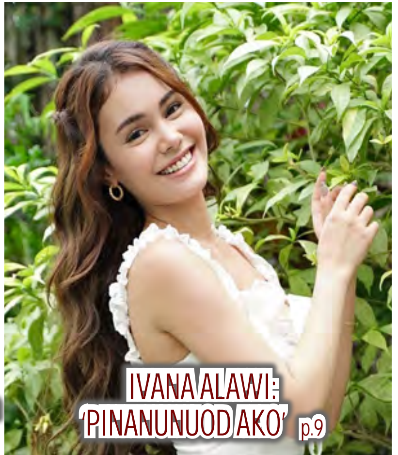
IVANA ALAWI: 'PINANUNUODAKO' p.9