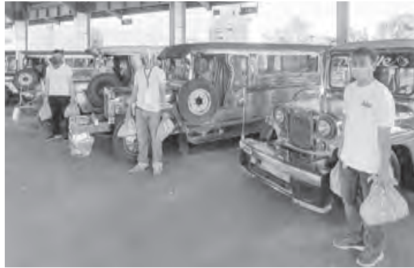
Jeepney drivers holding the Kalinga Packs with a smile.