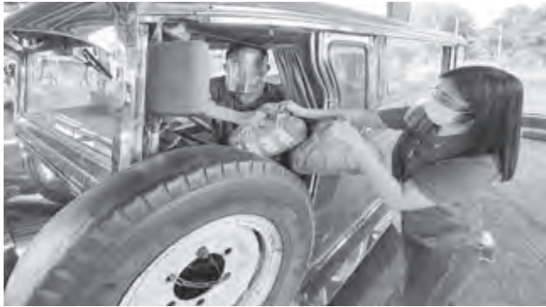
Driver from GMA SM BACOOR JODA INC , enthusiastically received his Kalinga packs.

Operation Tulong Express in SM Supermalls headed by SM Foundation has been rolling for a month already. However, first distribution was not enough to cater all beneficiaries, which is why second round is needed for some Malls like SM City Dasmariñas which recently had its second Operation Tulong Express. Around 300 Kalinga Packs from SM City Dasmariñas and SM Foundation were distributed to 7 Group of Transport Operators in SM City Dasmariñas. Kalinga packs were consist of food, home essentials and rice. Pure happiness were embedded behind the drivers' mask as they receive the Kalinga Packs. Operation Tulong Express is one of the many programs of SM Foundation through the help of SM Supermalls in supporting communities.