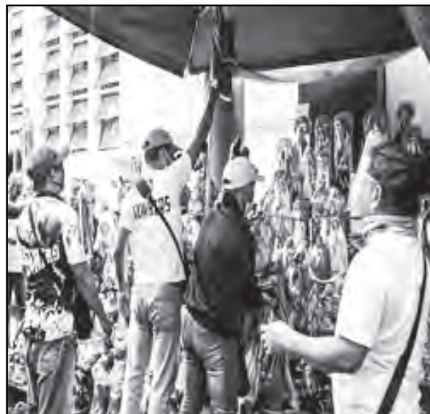
TULOY lang ang operasyon ng mga tauhan ng Hawker Section ng Manila City Hall laban sa mga nagtitinda sa paligid ng Quiapo Church na hindi sumusunod sa social distancing. Kinumkumpiska ang ilang paninda ng mga vendors na lumalabag sa alintuntuning mahigpit na ipinatutupad ng Maynila na health protocol ngayong General Community Quarantine (GCQ).

Narekober sa suspek ang di nabatid na kalibre ng baril, bala at sachet ng shabu.