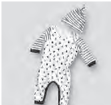
Letters frogsuit with bonnet from Pure