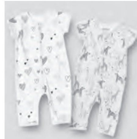
The little ones will love to jump into these hearts and safari frogsuits from Hush Hush