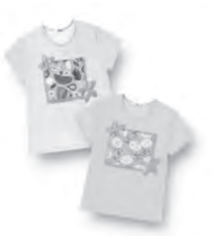
Color Changing Sequined Tee by Justees Girls