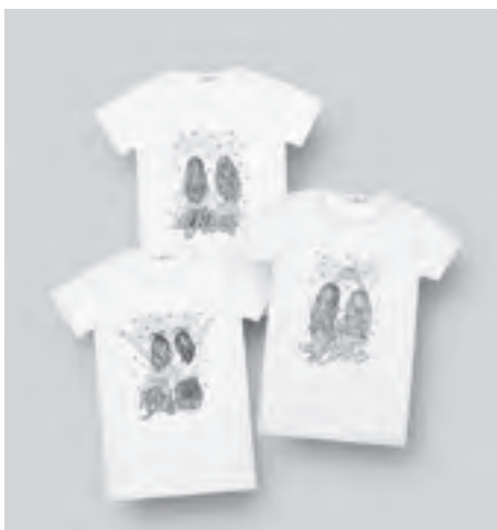
Graphic Tee by Justees Girls