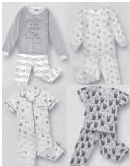
All day pajamas for girls from SM Kids