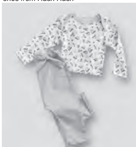
Birds bodysuit and pants from Pure