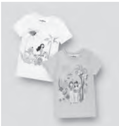
Tropical Graphic Tee by Justees Girls