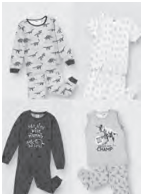
Pajamas for boys from SM Kids