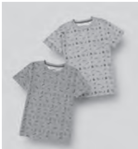
Nautical Graphic Tee from Justees Boys