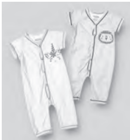
Unicorn and Lion bodysuits for the little ones from Hush Hush