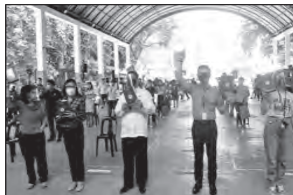
Turnover at Distribution of Learning Continuity Packages for Manila Public School Teachers at Students na isinagawa sa Melchora A. Aquino Elementary School sa Maynila.