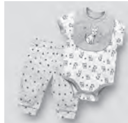
Dog onesie, pants, and bib set from Pure