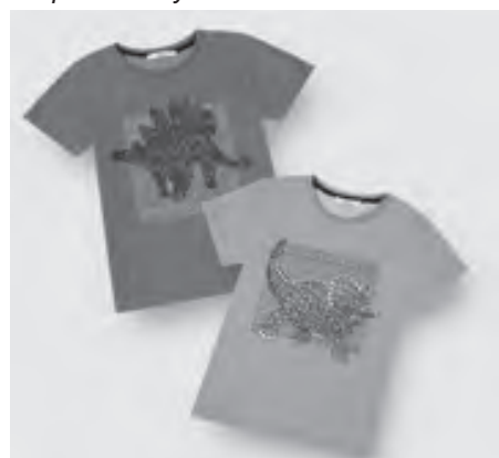
Dino Graphic Tee from Justees Boys