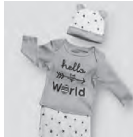
Hello world pajama and beanie set from Pure