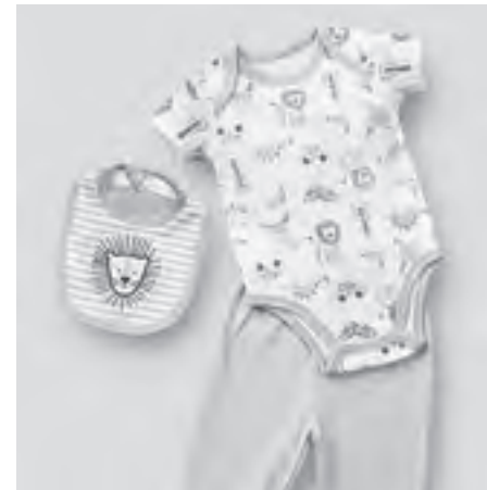
Pure three-piece set includes lion onesies, pants, and bib – 3pc set from Pure