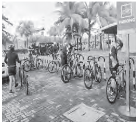
SM By the BAY's conveniently located wave bicycle racks offer secure and efficient parking for cyclists.

With SM's bike-friendly facilities, customers can look forward to a safe, convenient, and enjoyable biking experience. Importantly, SM aims to support inclusive mobility especially during the MECQ, and hopes to encourage more people to take up biking as a healthy and environment-friendly alternative means of transportation beyond the pandemic, which is part of SM's Green Movement campaign promoting clean, green, sustainable communities.