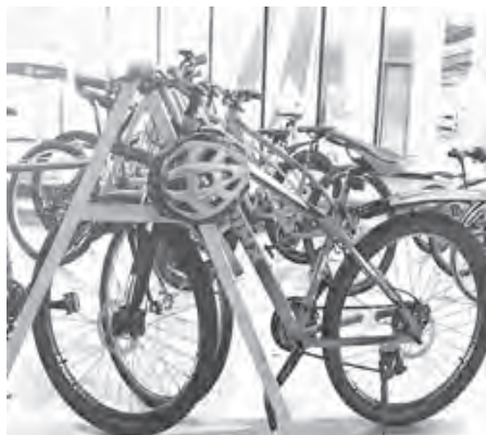
Customers can enjoy a safe, easy, and convenient parking experience at SM Aura's designated bike parking zone conveniently located near the mall's entrance.