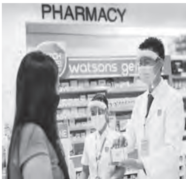
Need some health information? Go to your Watsons pharmacist. Watsons Philippines has a strong network of 1,436 pharmacists nationwide. They are professionally trained on healthcare and a reliable source of opinion to alleviate pressure on public health system