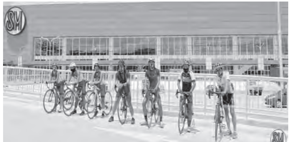
SM Olongapo Central's cycling community can enjoy its spaciouly designed bike facilities