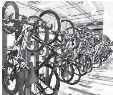
The Podium's covered bike parking facilities are conveniently located near the mall's driveway and feature upright bicycle racks designed for additional security and easy maneuverability for bikers.