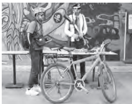
Bikers can enjoy safe parking at SM North Edsa's designated bike parking area. Bikers simply register in a logbook and submit ID for a bike parking pass as an added layer of security and peace of mind.