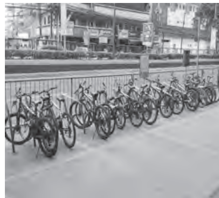
Street-level parking right in front of SM BF Paranaque's entrance provides an easy, safe, and convenient parking experience for the mall's bike-riding customers.