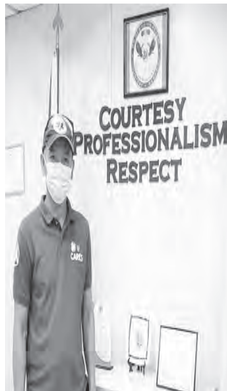
SM CITY BACOOR, CAVITE – Making a living and earning enough for the family is one struggle for us living in a third world country. The early morning grind and some

sidelines just to make ends meet are indeed tiring. But what could have happen if your hard-earned money falls into the wrong hands? Good thing we have honest Security personnel roaming around SM City Bacoor to return whatever belonging they retrieve from inspections.