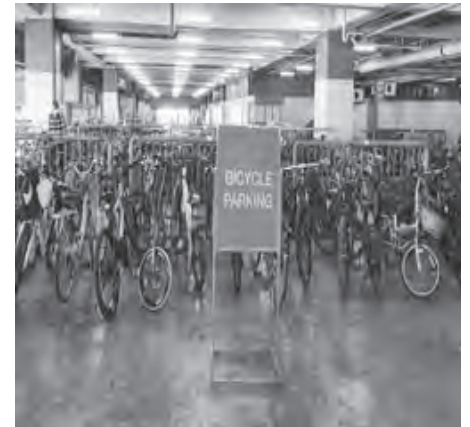
SM Marikina's organized and spacious parking zone dedicated solely for bicycles.