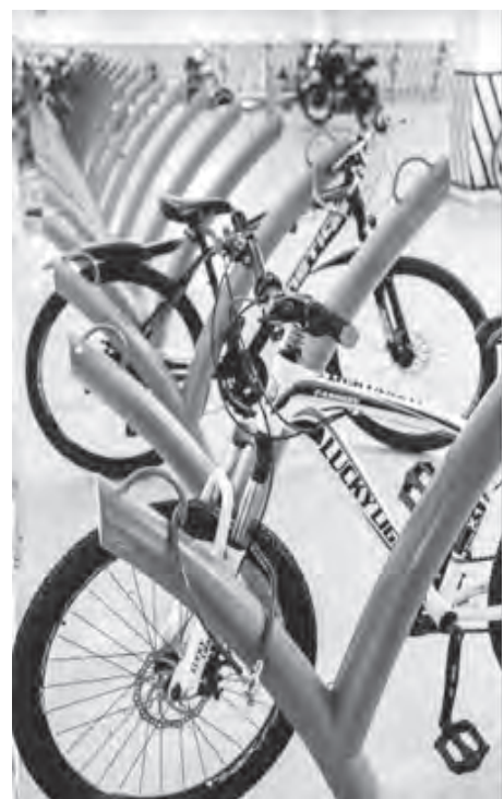
S Maison's covered bike parking area offers bike racks with multiple locking points for customers to easily secure their bikes.