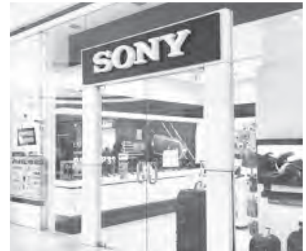
Grab your visual audio intelligent computers and smartphones from SONY VAIO