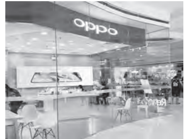
Check-out trendy mobile phone designs at OPPO .

to provide safe and efficient solutions for the benefit of its shoppers. For more information on the SM Dasmariñas Center Concierge and Cyberzone, follow SM City Dasmariñas on Facebook and Instagram.