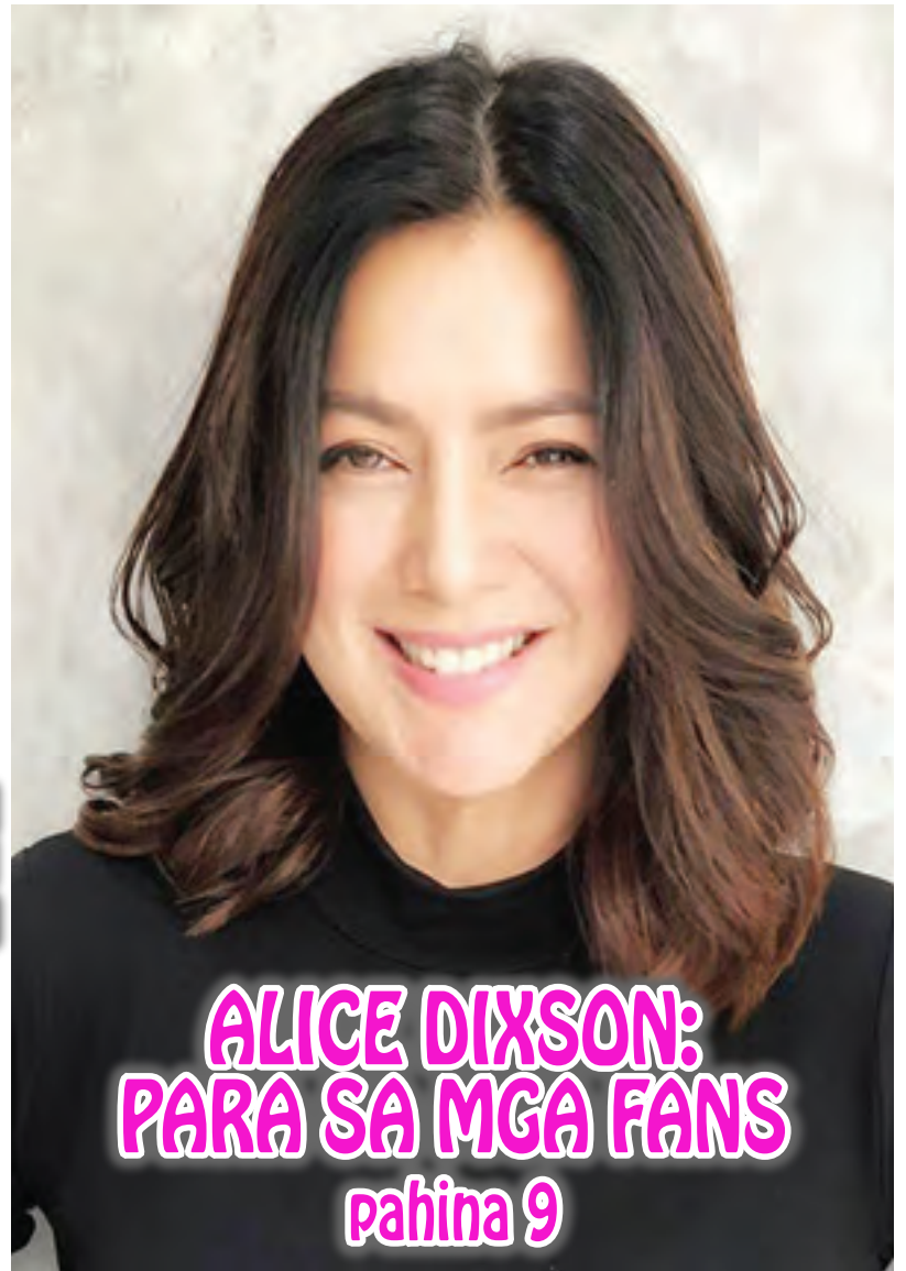
ALICE DIXSON: PARA SA MGA FANS pahina 9