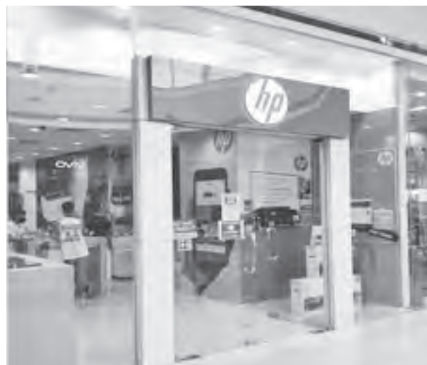
Get your computer set or laptop now from HP for the new normal schooling and meeting.