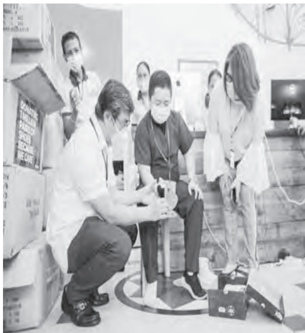
One of PGH frontliners showing her worn out shoes. She was first to choose from the shoes donation of Bata.