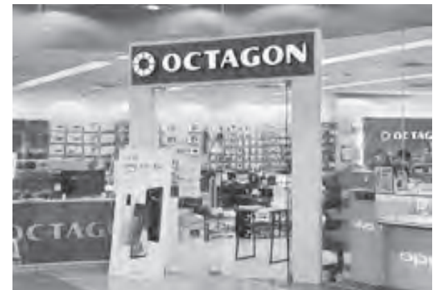
For any computer needs, go to Octagon SM City Dasmariñas.