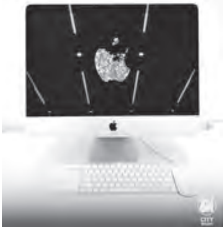
You can now order and pick up your essentials from Octagon, Switch, Gigahertz and Huawei!

With this, you can get yourself all the items you need to make working and studying easier!