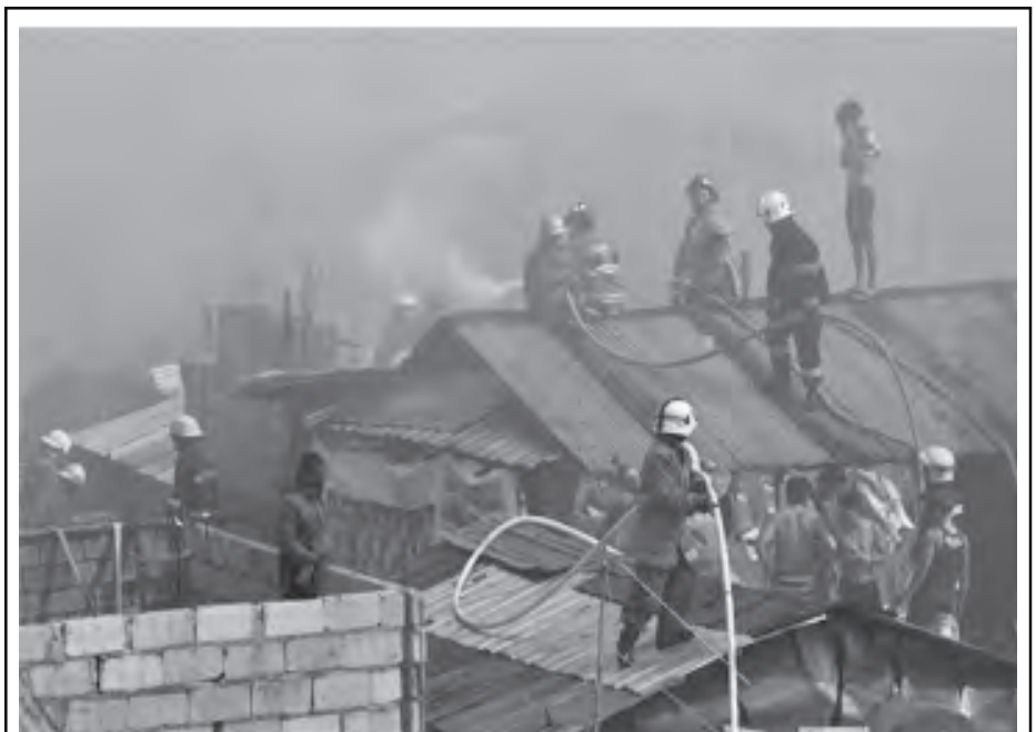
TINATAYANG 80-100 barung barong ang natupok ng apoy sa Blk.15 Baseco Compound, Gasangan, Port Area, Manila, dakong 2:45 ng hapon kamakailan na umabot sa 2nd alarm at tumagal ng isa at kalahating oras. CHRISTIAN HERAMIS

ilang buwan nang nahihirapan bumiyaha, at mga driver at operator na ilang buwan nang nagugutom. We should not prolong the suffering of our kababayans, especially in this time of crisis," Hontiveros concluded. PR