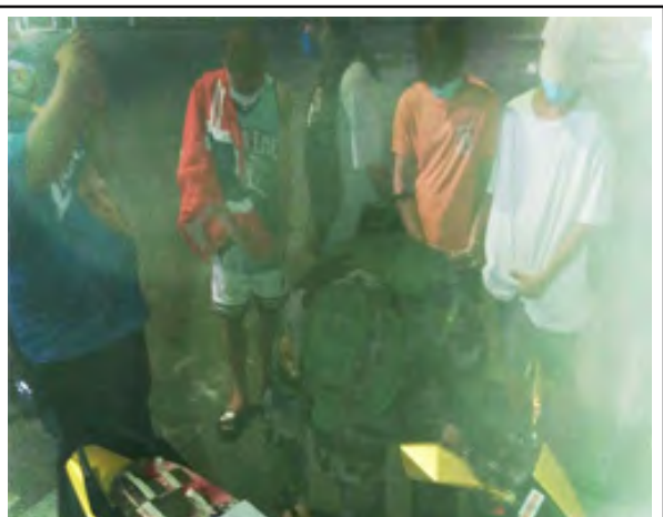
SA isinagawang Oplan GALUGAD ng PCP-2 ay apat na pawang menor de edad ang nahulihan ng marijuana sa Macapagal Ave., harap ng City of Dreams, Tambo, P'que City. Kasama ang mga tauhan ng barangay at DSWD na nagsilbing mga testigo.

Sa pagkakaalam natin, batay sa huling datos ay mahigit 20-milyong estudyante ang nakapagpatala na sa iba't ibang pampubliko at pribadong paaralan sa buong bansa.