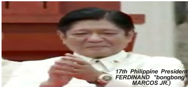
17th Philippine President FERDINAND "bongbong" MARCOS JR.

William "Butch" Ramirez, napanalunan ng Pilipinas ang kauna-unahang Olympic gold medal sa kagandahang-loob ni weightlifter Hidilyn Diaz sa Tokyo noong nakaraang taon.