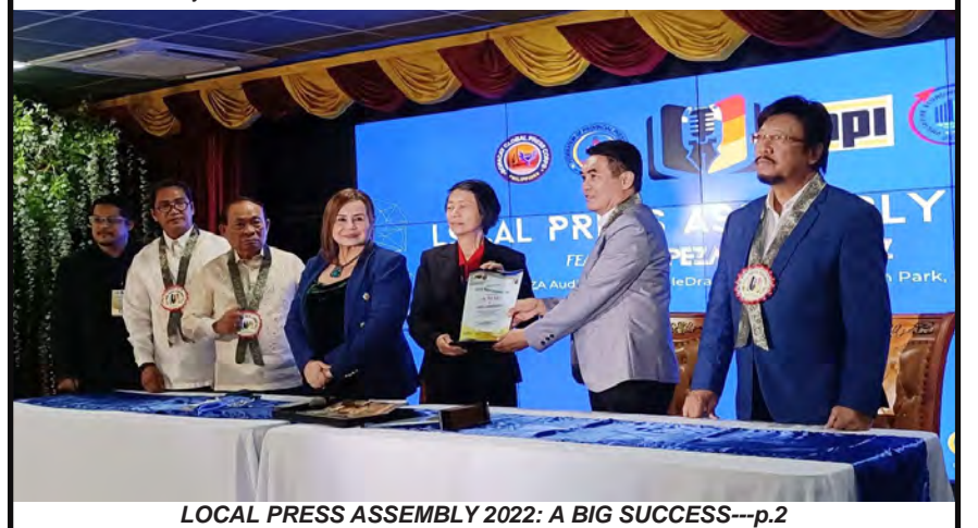
LOCAL PRESS ASSEMBLY 2022: A BIG SUCCESS---p.2

ACCEPTING ADS, PLEASE CALL: 0977-7844136/ 0968-7122927