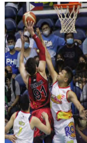
PBA SMB VS ROS

nagpalabas ng 27 puntos na may walong rebound, apat na steals, at tatlong block, habang si Roi Sumang ang nangako sa pagkawala ni Bolick at nagdagdag ng 24 puntos, apat na rebound, at 10 assist para sa NorthPort, na bumagsak sa 2-4.