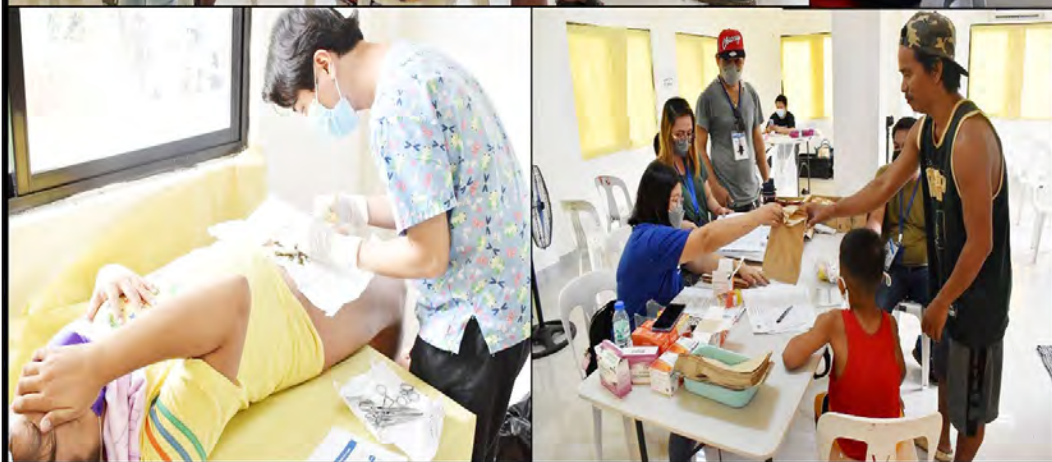
PGC conducts Operation Tuli in Tanza---p.2