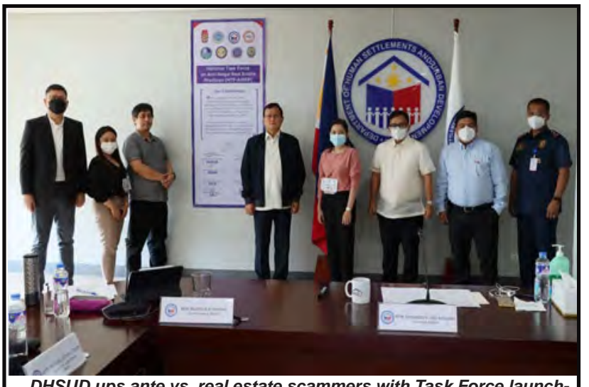
DHSUD ups ante vs. real estate scammers with Task Force launch--p.11