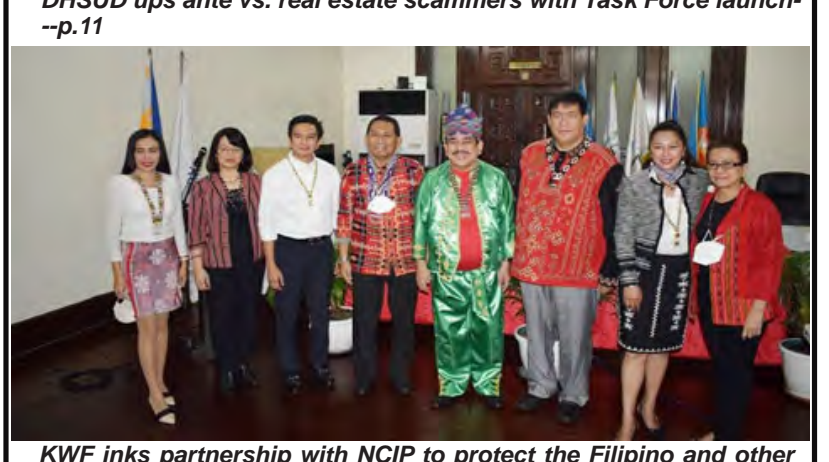
KWF inks partnership with NCIP to protect the Filipino and other Philippine Languages---p.11

ACCEPTING ADS, PLEASE CALL : 0977-7844136/ 0968-7122927