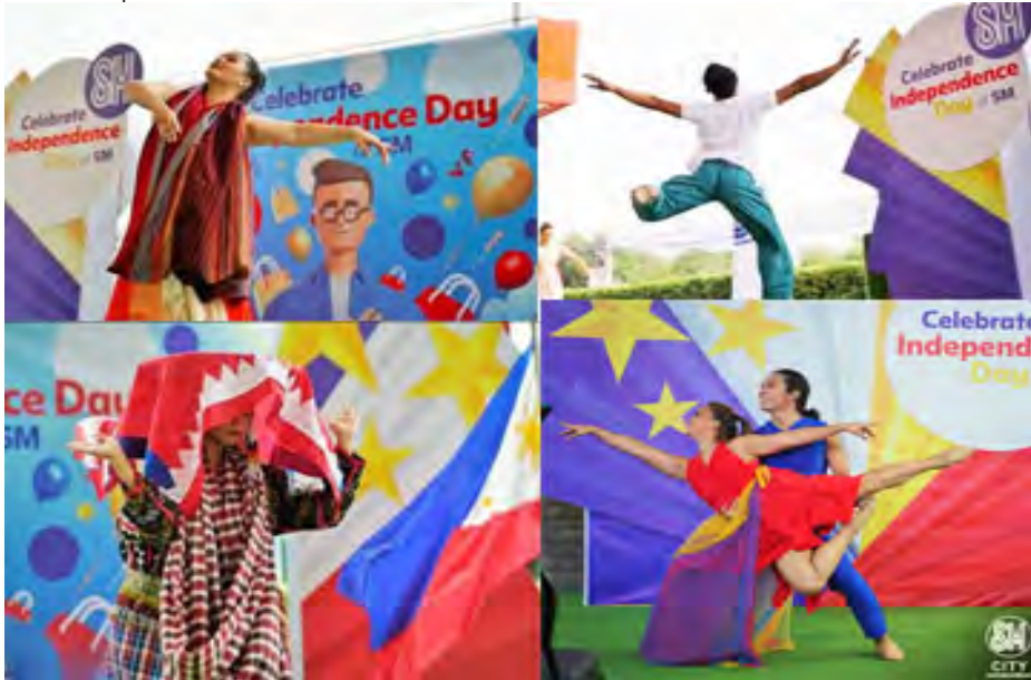
The artists from the La Salle Filipiniana and The Dance Lab performed at SM City Dasmariñas and SM City Bacoor.

SM CAVITE – SM City Dasmariñas, SM City Bacoor, SM City Molino and SM Center Imus employees, security personnel and guests salute to the Philippine Flag in commemoration of the country's 124th Independence Day. The Security Personnel headed Parade of Colors as everyone prepares for the flag raising. Paying tribute to our heroes who paved way for us to gain our independence, the malls celebrated the event with special cultural performances from La Salle Filipiniana and The Dance Lab in partnership with the National Commission for Culture and the Arts. The performers gracefully portrayed patriotic message through cultural dances. Also highlighting the modern day heroes such as our economic front liners, the mall managers gave encouraging messages to the Security force, housekeeping personnel, and employees for their courage to help boost the economy especially amidst the pandemic.