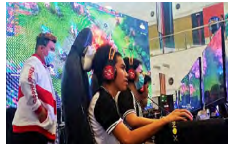
Himagsikan 2022 players carefully strategizing to defeat their opponents live.