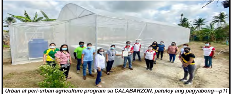
Urban at peri-urban agriculture program sa CALABARZON, patuloy ang pagyabong---p.11

ACCEPTING ADS, PLEASE CALL: 0977-7844136/ 0968-7122927