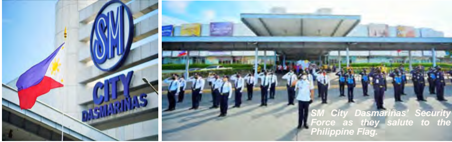
SM City Dasmariñas' Security Force as they salute to the Philippine Flag.

SM CAVITE – SM City Dasmariñas, SM City Bacoor, SM City Molino and SM Center Imus employees, security personnel and guests salute to the Philippine Flag in commemoration of the country's 124th Independence Day. The Security Personnel headed Parade of Colors as everyone prepares for the flag raising. Paying tribute to our heroes who paved way for us to gain our independence, the malls celebrated the event with special cultural performances from La Salle Filipiniana and The Dance Lab in partnership with the National Commission for Culture and the Arts. The performers gracefully portrayed patriotic message through cultural dances. Also highlighting the modern day heroes such as our economic front liners, the mall managers gave encouraging messages to the Security force, housekeeping personnel, and employees for their courage to help boost the economy especially amidst the pandemic.