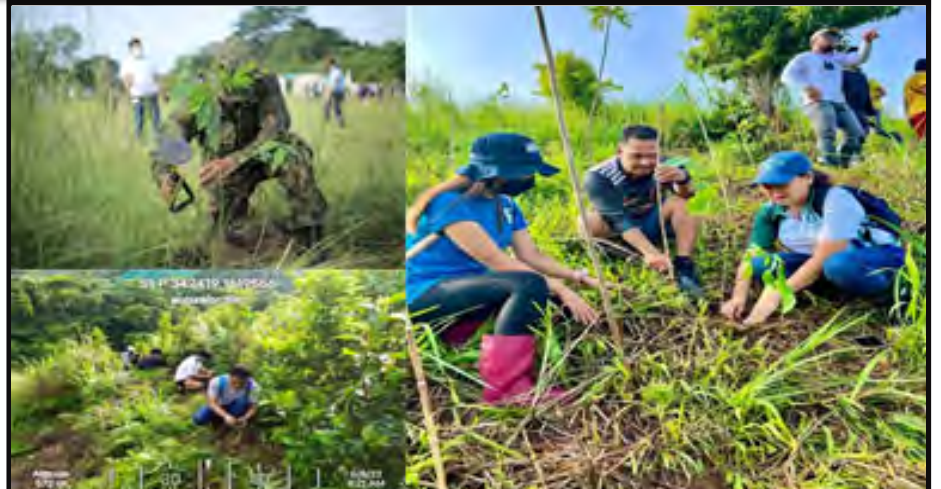
Philippine Environment Month Jumpstarts Regreening Efforts in CALABARZON---p.10