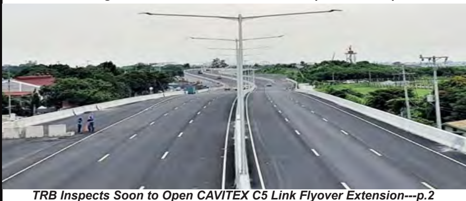
TRB Inspects Soon to Open CAVITEX C5 Link Flyover Extension---p.2