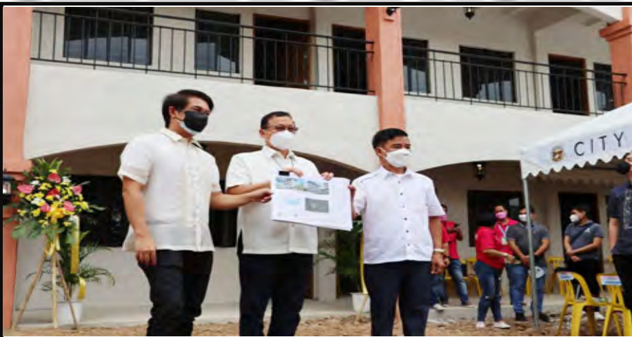
Housing czar 'satisfied' with DHSUD accomplishments---p.2

New app users can also enjoy P200 off on their first delivery order, just use the code SMGOESONLINE without minimum purchase. Download the SM Malls Online App now, available on IOS and playstore.