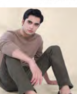
Salvatore Mann Armon Sling Bags from The SM Store.