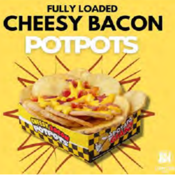
SM CENTER IMUS, CAVITE - Who doesn't love cheese and bacon? Indulge in cheesy and bacon-y potpots when you order from Potato Giant - SM Center Imus. Perfect snack to keep your day warm, smooth, and cheesy! Go and grab this super-cheesy bacon treat because you deserve it