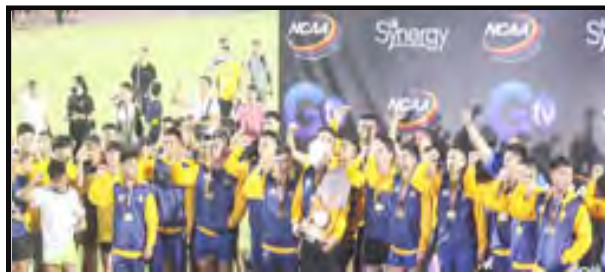
JRU NCAA SEASON 98 TRACK AND FIELD OVER ALL CHAMPION TINANGHAL na NCAA Season 98 track and field over all champion ang koponang JRU Jose Rizal University makaraang sila ang may pinakamaraming panalo sa mga events na kanilang nilahukan na ginanap sa PhilSports Track and Field Oval Pasig City.