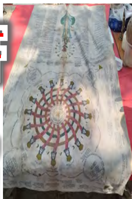
TALANDRO is the amulet in cloth form.