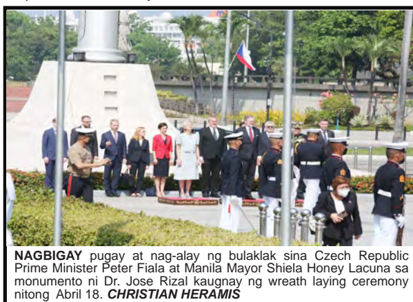
NAGBIGAY pugay at nag-alay ng bulaklak sina Czech Republic Prime Minister Peter Fiala at Manila Mayor Shiela Honey Lacuna sa monumento ni Dr. Jose Rizal kaugnay ng wreath laying ceremony nitong Abril 18.

Ang Gawad Dangkal ng Panitikan ay ang mataas na pagkilala sa naiambag sa panitikang Pilipino o lifetime achievement award. Binibigyang-pagpupugay nitó ang natatanging manunulat na nagpakita ng pagpapahalaga sa kultura, kaakuhan, at kayamanan pamana, bukod sa pambihirang pagkasangkapan sa Filipino at iba pang wikang panrehiyon o panlalawigan.