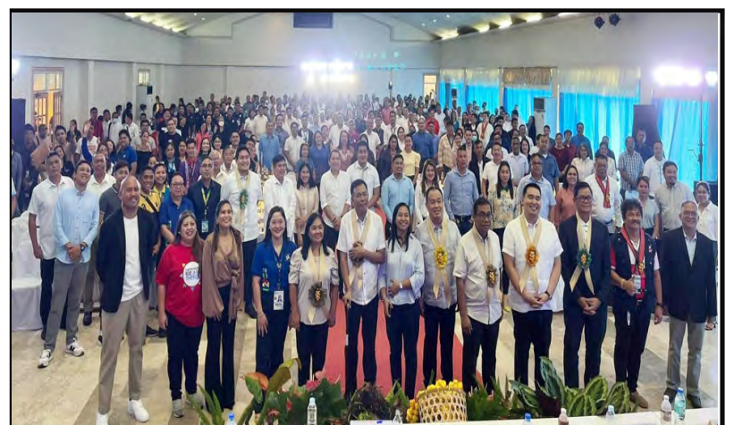
Camiguin Rep, LCEs update Contingency Plan on Volcanic Eruption with DOST, OCD--p.5