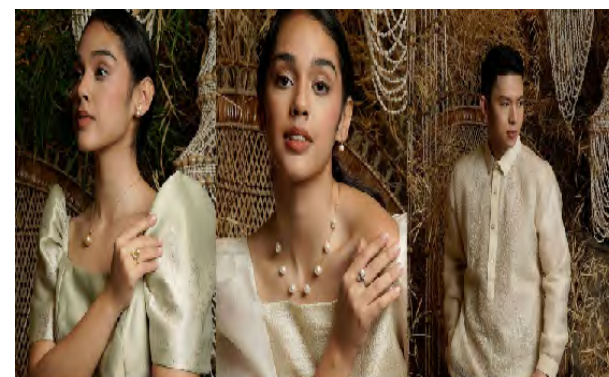
These yellow gold South Sea pearl earrings and ring complement this elegant Zenaida terno top. Pretty in pearls. A South Sea pearl necklace and freshwater pearl ring and earrings. Pina silk barong with intricate hand-embroidered calado for the groom.

SM CITY MOLINO, CAVITE - SUMMER FUN continues at SM City Molino because FREE ticket pass on the Summer Color Drift awaits you! Just follow SM City Molino on our TikTok www.tiktok.com/@smcitymolino and share the post tagging 3 of your friends and family you wanna invite on a DRIFT DATE and make sure they follow SM City Molino too! Comment the hashtag #AweSMBurstOfSummer and your TikTok account when DONE. There will be three FB winners to be randomly selected to win 4 FREE DRIFT tickets. Winners will be announced on June 10, 17 and 24, 2022 on SM City Molino's Facebook page. Join now!