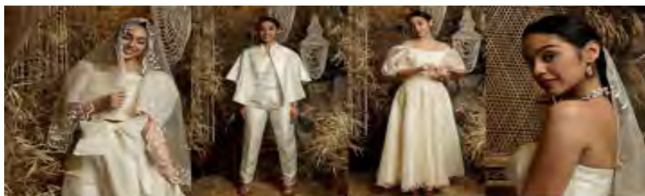
FILIPINIANA FOR THE MODERN BRIDE. Amor embroidered calado cropped top with terno sleeves, silk cocoon skirt with a ruffled hem, and embroidered veil from Kultura. Cristina beaded blazer worn with shantung silk pants. So, divine! Divina embroidered and beaded organza gown worn with pearl earrings and necklace. Exquisitely embroidered tulle veil.

Grooms can choose from Kultura's selection of elegant barongs in Piña Silk, Silk Cocoon, Cotton Silk, Organdy, and Jusi materials with intricate embroidery details. Favors, tablescape dining accessories, entourage gifts,