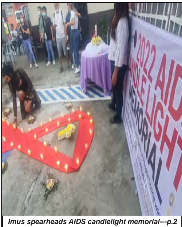
Imus spearheads AIDS candlelight memorial---p.2