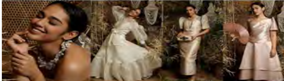
Baroque pearl statement neckpiece. Lea embroidered top with balloon sleeves worn with a silk cocoon skirt with a ruffled hem. Marian cutwork bolero with terno sleeves over a spaghetti strap gown in Mikado silk. Worn with a freshwater pearl necklace. Marian cutwork bolero with terno sleeves over a spaghetti strap gown in Mikado silk. Worn with a freshwater pearl necklace.