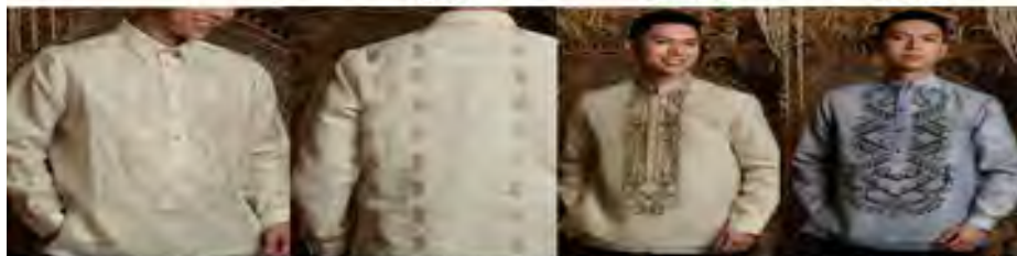
Jusi barong with embroidery details on sleeves and back. Organdy barong with embroidered sleeves and back. Kultura's handpainted jusi barong for the modern groom. Embroidered blue organdy barong with a mandarin collar

and decors are also available making Kultura a one-stop shop for your Filipino-themed wedding. Check out Kultura's Selebrasyon