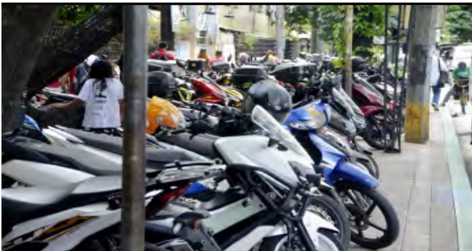
KAPANSIN-PANSIN ang mga nakaparadang motorsiklo sa kahabaan ng United Nations Ave. sa Maynila, partikular sa tapat ng National Bureau of Investigation (NBI) at Araullo High School, na nakasampa sa bangketa.