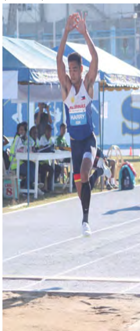
TRIPLE JUMP MEN OPEN DIONES