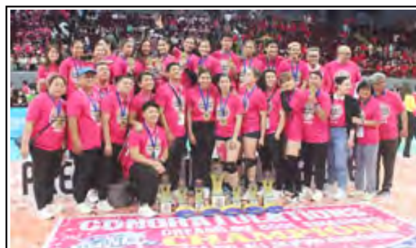
PVL CHAMPION CREAMLINE COOL SMASHERS