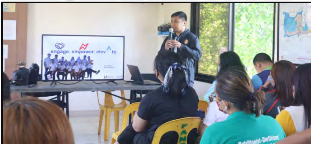
DOST empowers 3 island communities in Dagupan City thru S&T program---p.11