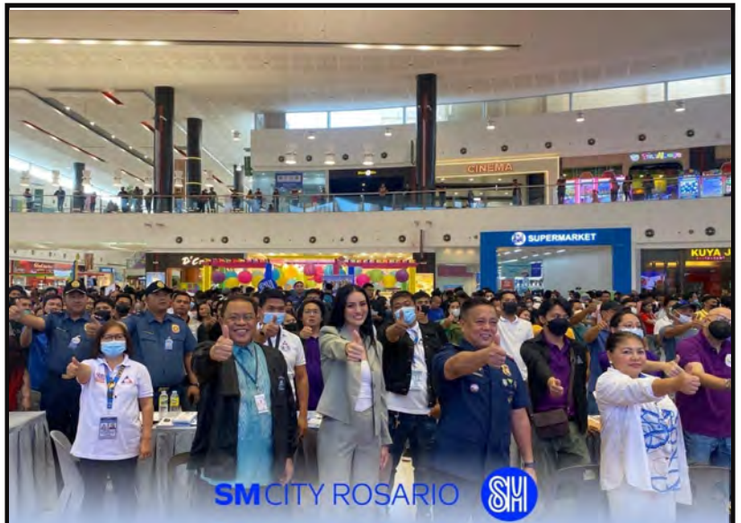
1 libong trabaho abroad para sa Caviteño at SM City Rosario Together with the Provincial Government of Cavite, the Department of Migrant Workers, the Philippine Army, the Philippine National Police, PESO of Cavite LGU, United Filipino Global and SM City Rosario, successfully held a job fair! With more than 20 companies offering careers to 3,000 applicants, these diverse job opportunities abroad will surely open doors to many Filipinos.