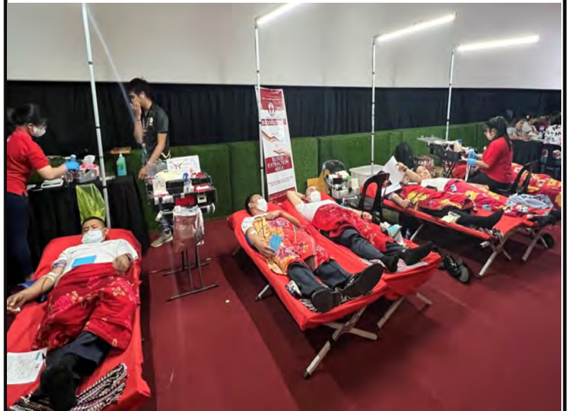
SM Marketmall and SM City Dasmariñas hold blood donation drive Philippine Red Cross, SM Foundation, SM Marketmall and SM City Dasmariñas recently held a blood donation drive. Shoppers, Tenant and SM employees participated in the event.