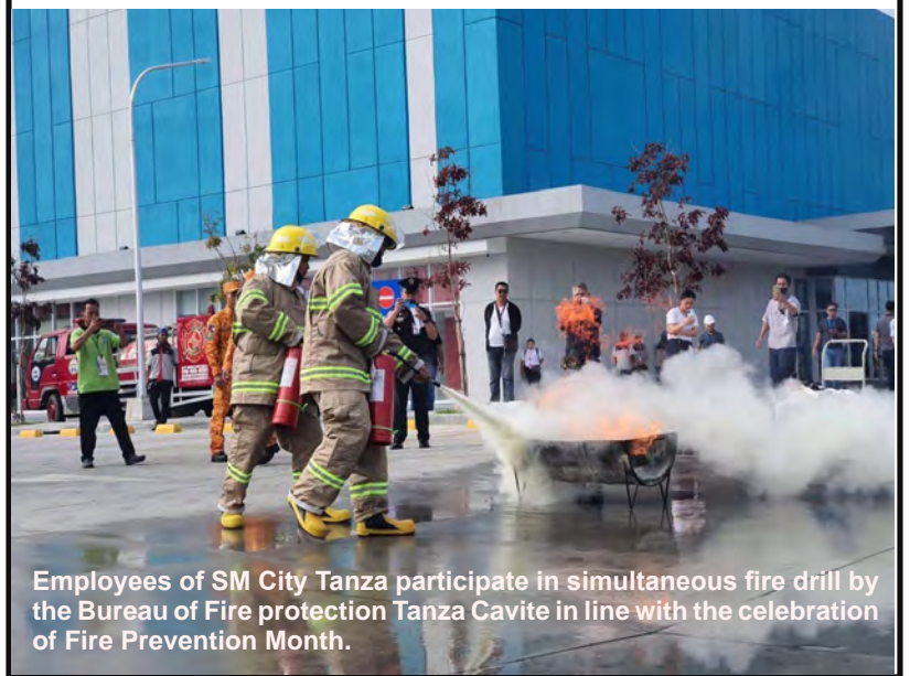
Employees of SM City Tanza participate in simultaneous fire drill by the Bureau of Fire protection Tanza Cavite in line with the celebration of Fire Prevention Month.

ACCEPTING ADS, PLEASE CALL: 0977-7844136/ 0968-7122927