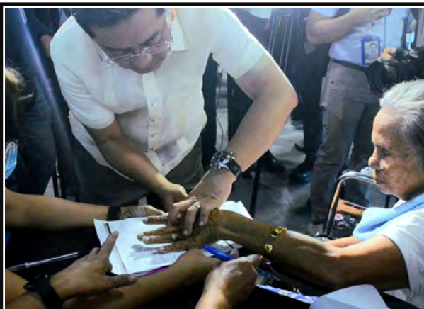
MISMONG si Commission on Elections Chairman George Garcia ang personal na umasiste sa isang matandang babaing humabol sa huling araw ng rehistrasyon nitong Enero 31 na ginanap sa isang mall sa Maynila. Ayon sa opisyal ay naabot ng komisyon ang target na 1.5 milyong rehistradong botante.