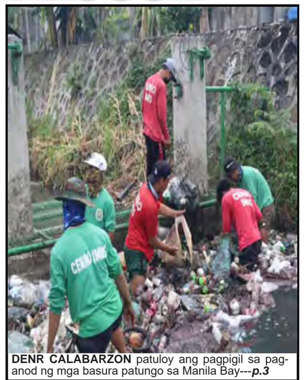
DENR CALABARZON patuloy ang pagpigil sa pag-anod ng mga basura patungo sa Manila Bay---p.3

ACCEPTING ADS, PLEASE CALL: 0977-7844136/ 0968-7122927