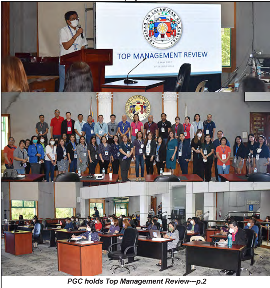
PGC holds Top Management Review---p.2