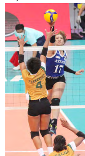
Ateneo VS FEU