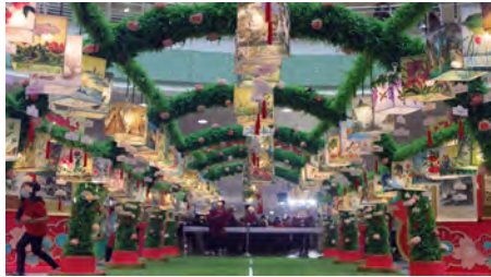
The lantern art tunnel is an attraction to the Chan Lim Exhibit with 150 hanging art lanterns.

Chinese New Year came early at SM City Dasmariñas through the opening of the 43rd Chan Lim exhibit which features 350 artworks by 60 artists. The Chan Lim Family and SM Supermalls go way back to 1995, when the first Chan Lim Family Art Exhibit was held at SM Megamall. Through the years, SM Supermalls and the Chan Lim Family grew together. The Chan Lim exhibit being held at SM City Dasmariñas today until February 19 is the longest Chan Lim Family of Artists and Students Exhibit to date, with 36 days. This truly marks a Celebration of Prosperity and Love, encompassing both the festivities of the Chinese New Year and the feel of Valentine's Day.