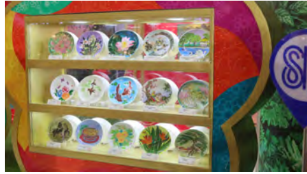
Chan Lim exhibit also has porcelain painting. Porcelain painting was developed originally in China.