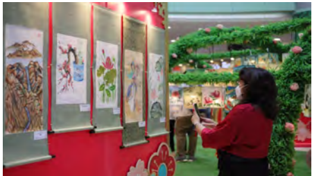
Artworks on scrolls are also displayed at the Chan Lim exhibit in SM City Dasmariñas.