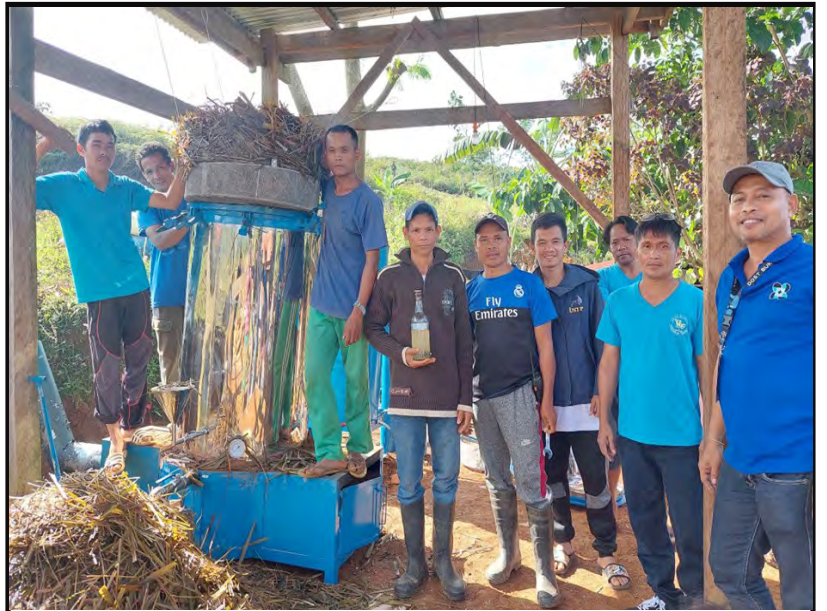
DOST REALIZES CITRONELLA FACILITY FOR HIGAUNON FARMERS IN MALITBOG - pahina 4