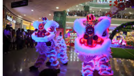
During the Chan Lim Launch, Dragon and Lion dance sparks Chinese New Year celebration at SM City Dasmariñas.