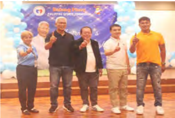
SIGN 1 PSC CHAIRMAN