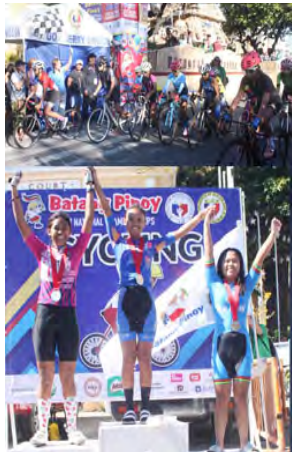
Cycling Criterium girls 14-15