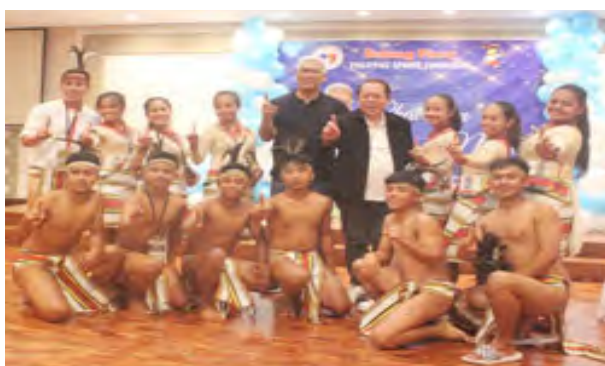
PSC CHAIRMAN / ILOCOS GOVERNOR