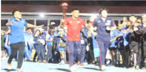
Opening ceremony torch bearer Olympic silver medalists Carlo Paalam at Nesthy Petecio at Olympic judoka Kiyomi Watanabe