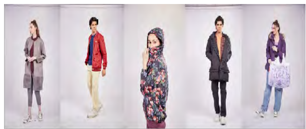
a big way with this biazing red number, making a tricolor statement with a