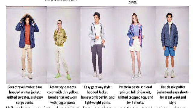
knitted sweater, and easy cargo pants.