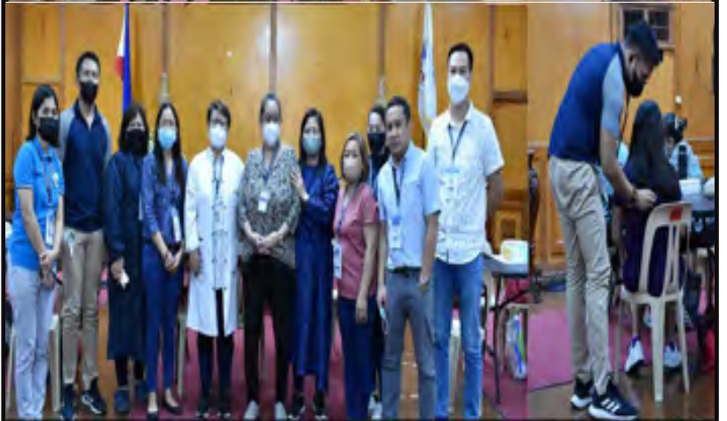
PGC provides medical services for PWD employees---Around thirty (30) employees with disabilities of the Provincial Government of Cavite benefitted from the medical and dental mission organized by the Human Resource Management Office on September 21, 2022 at the Ceremonial Hall, Provincial Capitol Building, Trece Martires City. The medical and dental team of Gen. Emilio Aguinaldo Memorial Hospital rendered their services during the health event which is part of PGC's Employees Month Celebration.