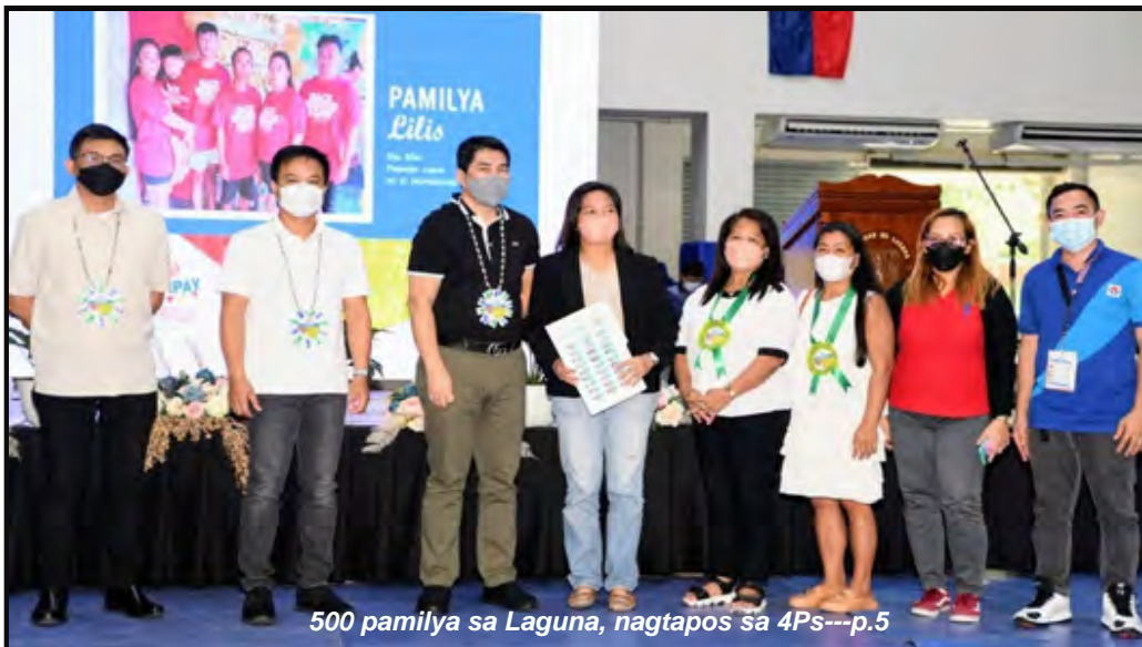
500 pamilya sa Laguna, nagtapos sa 4Ps---p.5