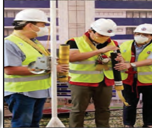
DSWD Secretary Erwin T. Tulfo spearheads the lowering of the time capsule during the groundbreaking ceremony of the proposed DSWD-Field Office IV-A in Lipa City, Batangas on September 2.--- story p.4