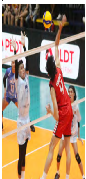
CIGNAL HD VS VNS ONE ALICIA

Maganda naman naging performance, nanalo kahit na