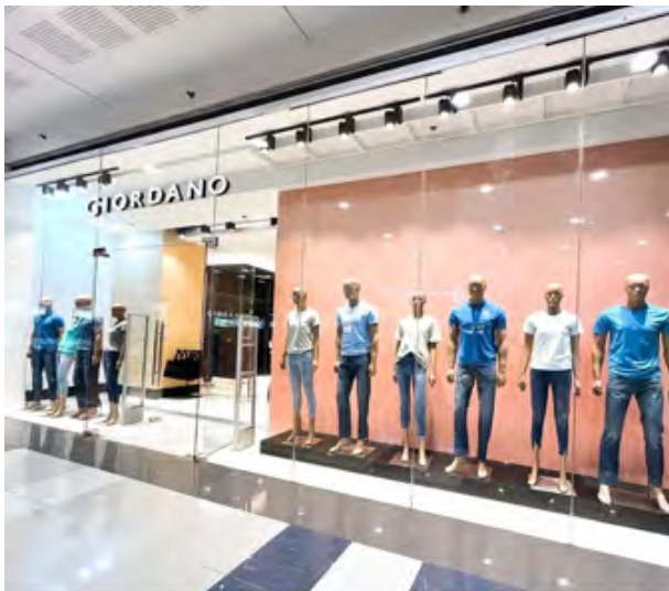
SM CITY DASMARIÑAS

Get your stylish and comfy outfit for your #OOTDs from Giordano's newly opened store at SM City Dasmariñas, located at the upper ground floor. Avail their end of season sale until September 30, 2022.