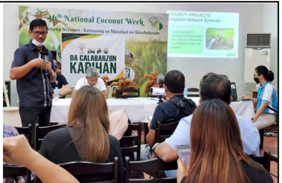
DA palalakasin ang industriya ng mais sa CALABARZON---p.4