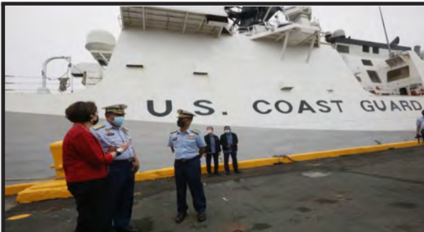
DUMATING na sa Pilipinas ang barko ng US Coastguard na 757 cutter midget na makiisa sa gagawing search and rescue training activity sa bansa kasama ang Philippine Coast Guard.