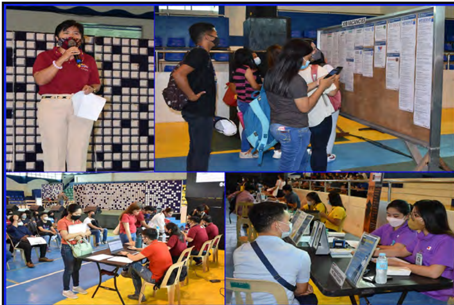
PPESO job fair offers employment opportunities to job seekers---p.2