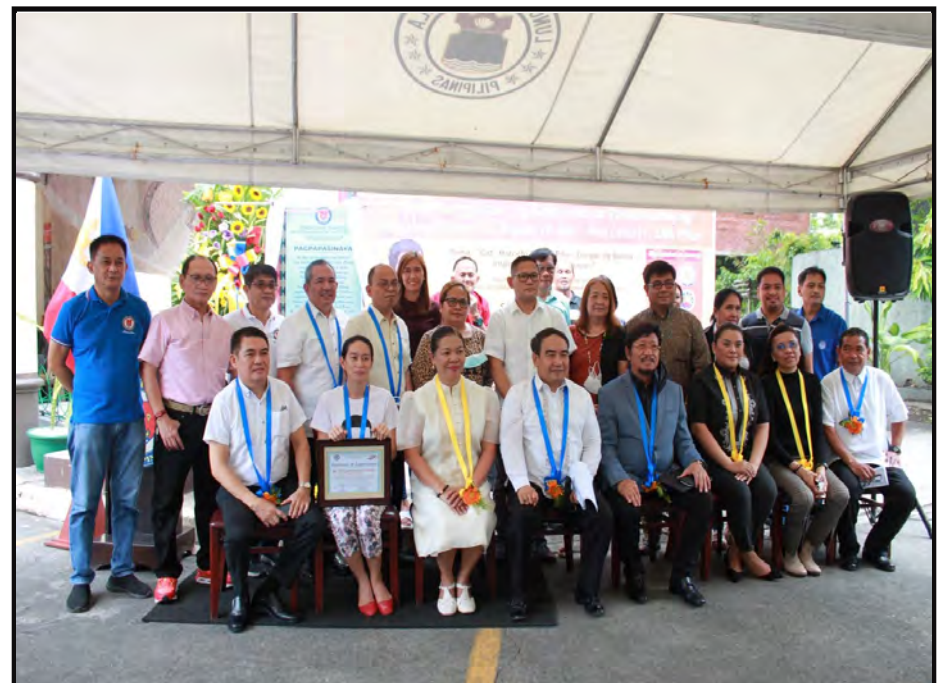
Dinaluhan ng mga mamamahayag mula sa iba't-ibang organisasyon at ahensya, kabilang na ang PAPI (Publishers Association of the Philippines, Inc.), ang ginanap na selebrasyong pinamunuan ng Pambansang Samahan ng Mamamahayag sa Pilipinas (National Press Club of the Philippines) na pinamagatang Pambansang Araw ng Kalayaan sa Pamamahayag kung saan ang tema ay "Gat. Marcelo H. Del Pilar: Dangal ng Bansa, Inspirasyon ng Mamamayan," Agosto 30, 2022 sa Bakuran ng Pambansang Samahan ng Mamamahayag sa Pilipinas. Ito ay ginanap upang magbigay pagyay sa tinaguriang Ama ng Peryodistang Pilipino na si Marcelo Del Pilar.