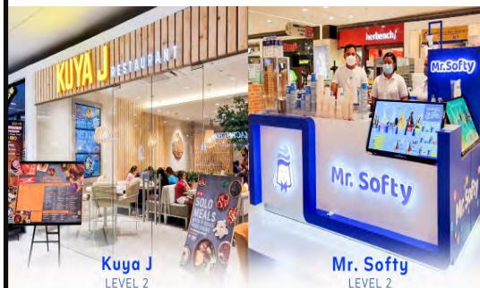
SM CITY BACOR, CAVITE – What's new at level two? Two of what you've always missed and craved for! SM City Bacor brings you a taste like home in a homy dining experience with Kuya J's great Filipino gastronomic delights, and Mr.Softy's smooth and creamy soft-served ice cream. Bring your family for a sumptuous lunch or dinner at Kuya J Restaurant and enjoy their savory Filipino dishes everyone loves! Got kids in the family? Treat them with Mr.Softy's soft-serve iced cream for a little sugar rush and happy smile! Head now with your family and kids at the 2nd Level of SM City Bacor and enjoy these.