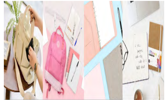
Metallic pink Casio calculator puts the glam in numbers. All in one school backpack for only Php 299. Minimalist Paper Source A5 and A6 planners to keep your schedule on track. Artherapy dotted notebooks will help you keep your goals on the dot.