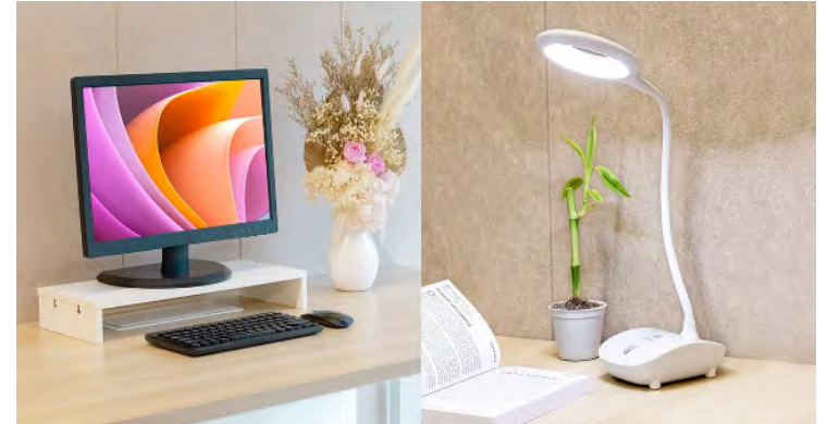
Monitor riser for your daily classes available at SM Stationery. Rechargeable desk lamp for your daily reading.

And of course, there are notebooks to keep one in track with lessons and schedules. Keep your kids creative with writing pads pens, as well as sketchpads for budding artists. Fun and fashionable backpacks, totes, and carry-all bags will help keep their things organized as they head off for school. All these and more are available at SM Stationery located in all The SM Store branches nationwide. For a more convenient shopping experience, check out https://smstationery.com.ph/ or ShopSM. Follow @smstationeryph on Facebook and @smstationeryph on Instagram for more exclusive deals and updates!