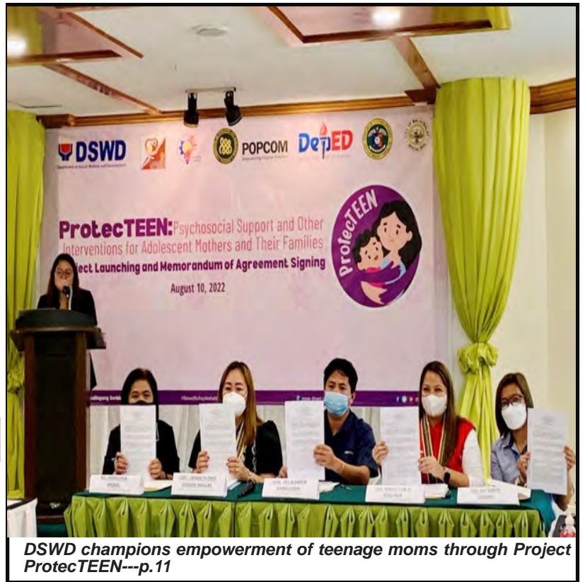
DSWD champions empowerment of teenage moms through Project ProtecTEEN---p.11