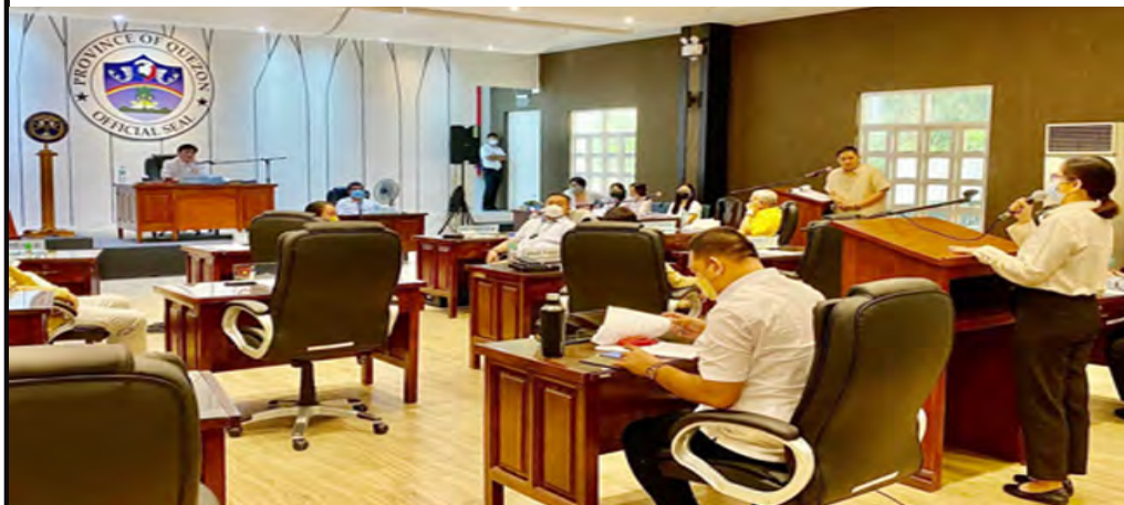
Bagong Provincial Health Officer kinumpirma ng Sangguniang Panlalawigan ng Quezon---p.2