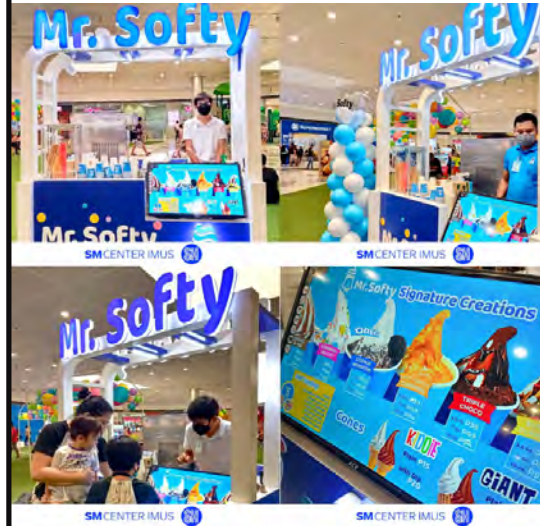
SM CENTER IMUS, CAVITE – Ice cream solves everything! So don't miss this cute kiosk that brings so much smiles on the faces of kids and those who are young at heart. Have a taste of the must-try Mr.Softy Signature Creations, flavor's you'll surely come back for! Visit Mr.Softy at SM Center Imus today and refresh your day in the sweetest way!