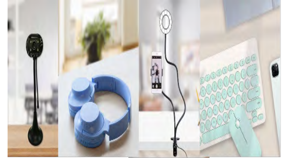
Stay selfie ready with this webcam with stand. Bluetooth headset for your online lectures. Selfie ring light with lazy pod available at SM Stationery. A pastel-colored mouse and keyboard combo for your online class set up.