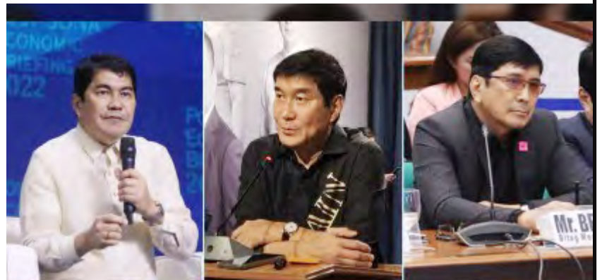
DSWD Secretary Erwin Tulfo (left); Senator Raffy Tulfo (center); and TV host Ben Tulfo (File photos) SC voids MTRCB sanctions vs. Tulfo brothers' show---p.10

ACCEPTING ADS, PLEASE CALL: 0977-7844136/ 0968-7122927