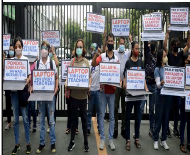
SUMUGOD sa punong tanggapan ng Department of Budget and Management DBM upang magkilos protesta ang Association of Concerned Teachers-Philippines. Nais nilang panagutin ang mga sangkot sa maanomalyang Laptop Deal na sa pagitan ng Department of Education at private company maging ang DBM sa halagang 58,000,000 na hindi akma, dahil sa bagal at outdated na mga laptops para sa distance learnings.