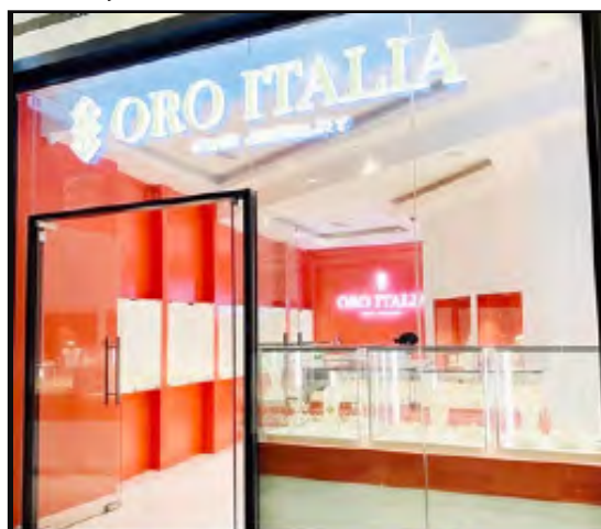
Oro Italia is now open at SM City TreceMartires- Looking for a statement jewel to partner up with your OOTD? Visit SM City Trece Martires' new jewelry store- Oro Italia! Be glam and stand out with the glitz and gold from Oro Italia Fine Jewelry!

Whether your kids are bound to attend face to face or virtual classes, SM Stationery has all the school stuff a student needs for the back to school season. Keeping up with the times, there are digital accessories ideal for e-learning. These include a wireless mouse, keyboard, headset, tripod, and monitor riser. These will surely make virtual schooling easier and more convenient for kids. A desk lamp would be the light stuff for your home school area.