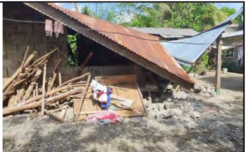
PPP eyed for resettlement projects in N. Luzon quake-hit areas---p.4