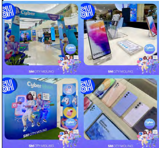
SM CITY MOLINO, CAVITE - Celebrate tech and innovation with the hottest tech deals and the lowest price guaranteed gadgets! Find the best devices and accessories fit for your vlogging, lifestyle, corporate, or online class needs. Experience all these and more this August at the #SMCyberMonth2022! Visit SM City Molino today and get these on great deals.