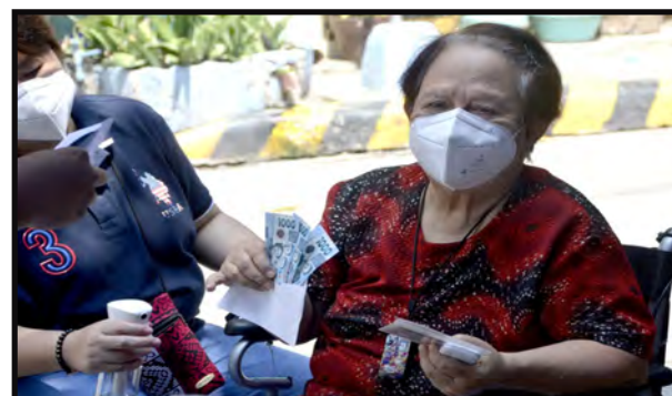
NAKATANGGAP ang 288 indigent senior citizens ng Barangay 630 Zone 30 District VI Sta. Mesa, Manila ng monthly allowance mula sa lokal na pamahalaan na natigil dahil sa kawalan ng pondo.