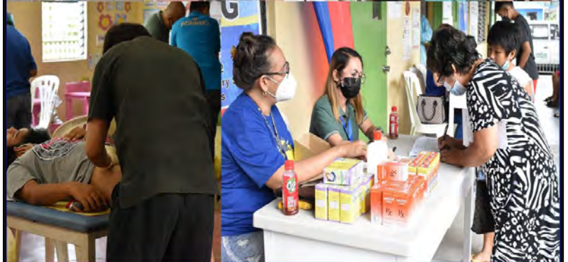
Operation Tuli in Imus City---p.2