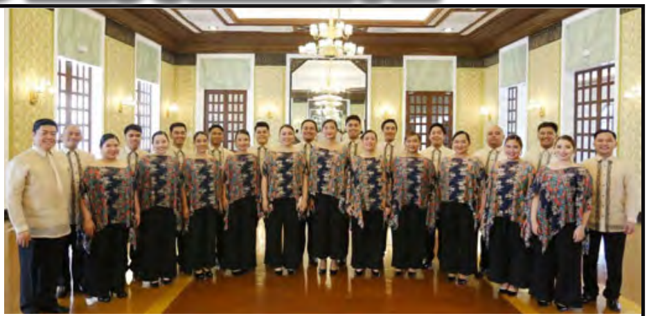
NCCA launches album of national artists' works featuring the Madz---p.4

ACCEPTING ADS, PLEASE CALL: 0977-7844136/ 0968-7122927