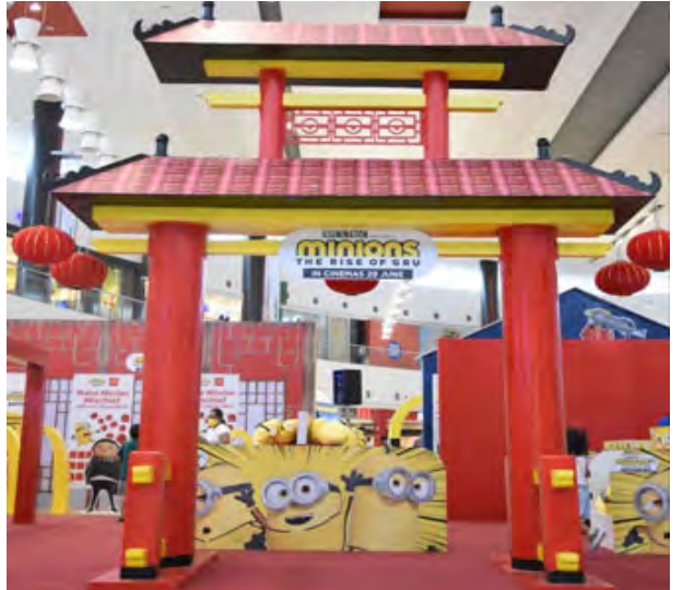
Minions Fun Playhouse at SM City Rosario