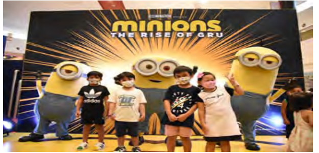
Kids grabbed the chance to take photos with the Minions

SM City Rosario set up the Minions Fun playhouse recently at its event center, making it a huge attraction for the shoppers. Kids and kids at heart enjoyed a cheerful and fun-filled afternoon with Bob, Kevin and Stuart as they played, sang and danced at the playhouse.