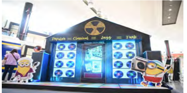
This is the music area of the playhouse where kids can dance, sing and record their voice.