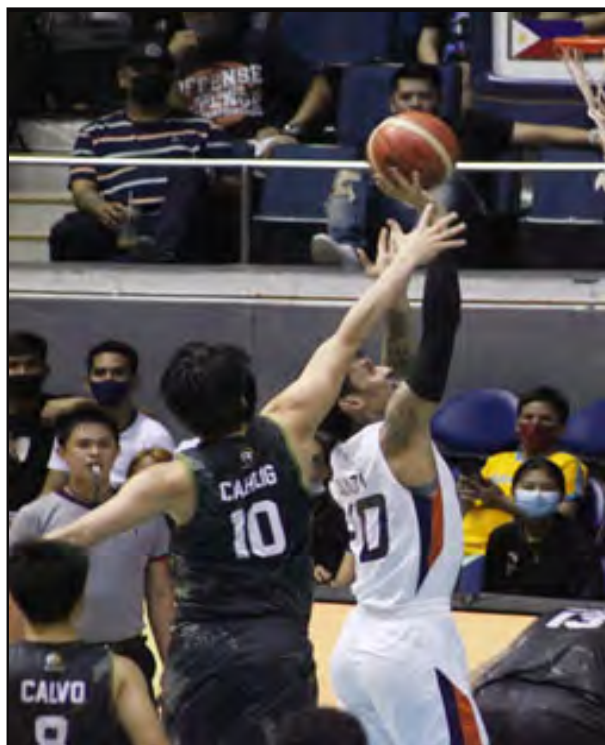
PBA MERALCO VS TERRAFIRMA

Si Ray-Ray Parks ay gumawa ng 16 puntos, isang rebound, at tatlong assist para sa Gilas, na hindi nakapasok sa quarterfinals ng FIBA Asia Cup sa unang pagkakataon mula ng hindi nakuha ng isang PBA-star-laden roster ang playoffs ng 2007 edition, na kawili-wili sa kasalukuyang Gilas coach. Si Chot Reyes din ang mentor ng Powerade-backed squad.