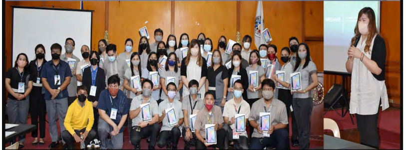
37 Cavite public school teachers receive K-Edu package---p.2