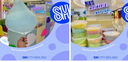
SM CITY MOLINO, CAVITE - Dreamin' about cotton candy and skies? Pio's Cotton Candy is now open here at SM City Molino! Visit them at the Second Level to grab some sweet treat for the kids at home and young at hearts because everyone deserves something sweet! Hurry and grab these fun and colorful treat now!