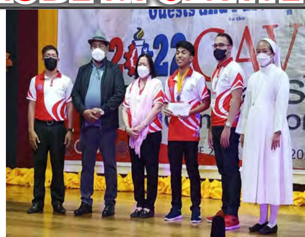
Sisters of Mary-Boystown tops TESDA's Prov'l Skills completion---p.2