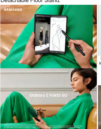
with this stunning Samsung Galaxy ZFold 3. You can win this 5G Smartphone with 6.2 inch wide screen and 512 GB memory as a major prize during the Gadgets Everyday raffle draws.

At your home entertainment center, upgrade your movie nights to an ultimate cinematic experience with the Samsung The Serif TV's elegant white frame, QLED technology and smart features that elevate streaming standards. You may move The Serif literally anywhere in the room because of its Detachable Floor Stand.