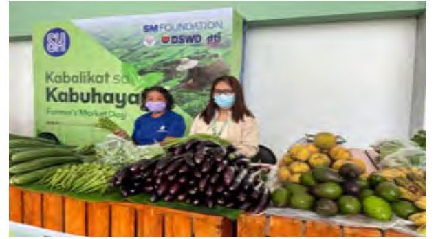
Kabalikat sa Kabuhayan Farmers and their quality produce

SM Foundation's Kabalikat sa Kabuhayan is a 14-week long agri-training program that teaches participants basic and advanced organic farming techniques and agripreneurship. It is a sustainable agriculture program that uplifts the lives of its stakeholders and benefits the community as well