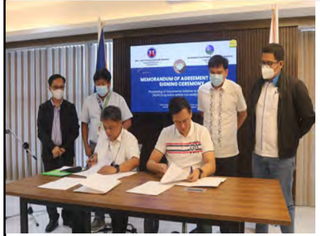
DENR and DPWH CALABARZON Offices to Fast-track Approvals of Plans for Road Right of Way---p.9

SM CITY BACOOR, CAVITE - Chicken is one of the most popular meals in the Philippines. There are thousands of ways to prepare it so we want to give you the unique taste of chicken you deserve. We have the ultimate dish and combo that you'll surely love. From Fried Chicken to Chicken Burger. We assure you that you will love our mouth-watering chicken perfectly served. So come and have a taste of the best Chicken in China!