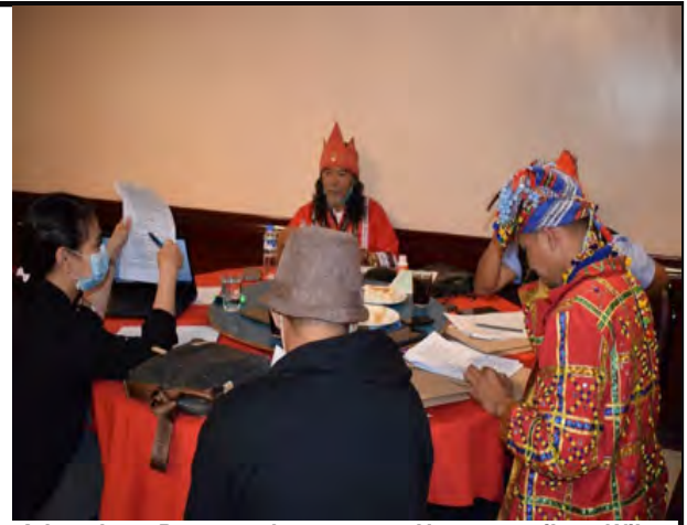
Adyenda sa Pangangalaga ng mga Nanganganib na Wika, isinusulong ng KWF---p.11

ACCEPTING ADS, PLEASE CALL: 0977-7844136/0968-7122927