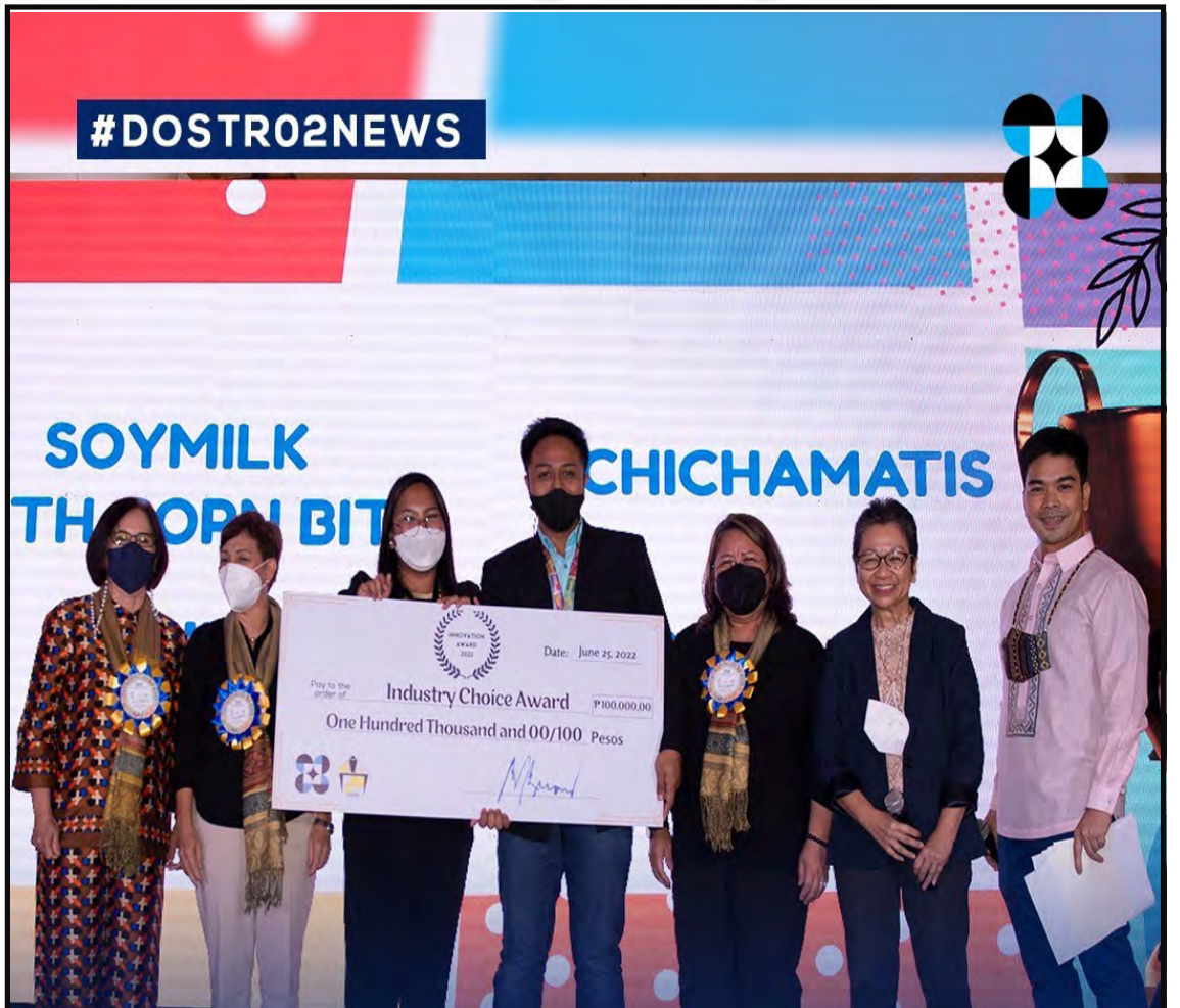
DOST, CSU get prestigious Industry Choice Awards for FICs---p.5

ACCEPTING ADS, PLEASE CALL: 0977-7844136/ 0968-7122927