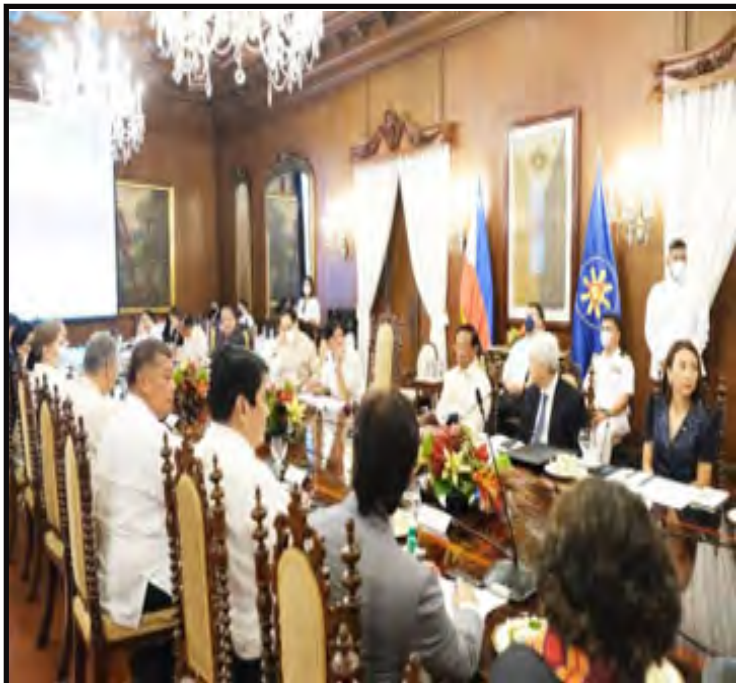
CABINET MEETING. President Ferdinand "Bongbong" Marcos Jr. presides over the first Cabinet meeting at Malacañan Palace on Tuesday (July 5, 2022). He said he plans to hold two Cabinet meetings a week to give his secretaries "a clear picture" of ways to address the country's main problems. ---story p.9