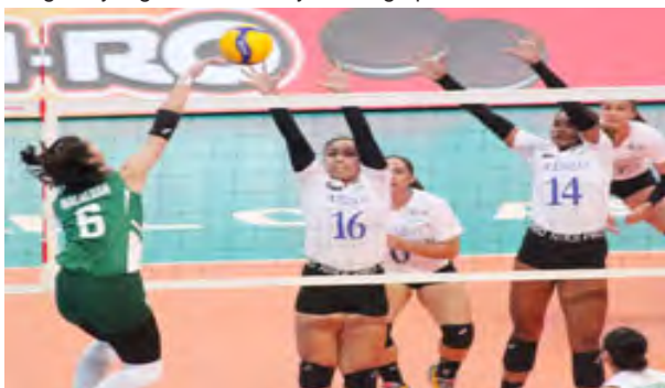
LA SALLE VS ATENEO