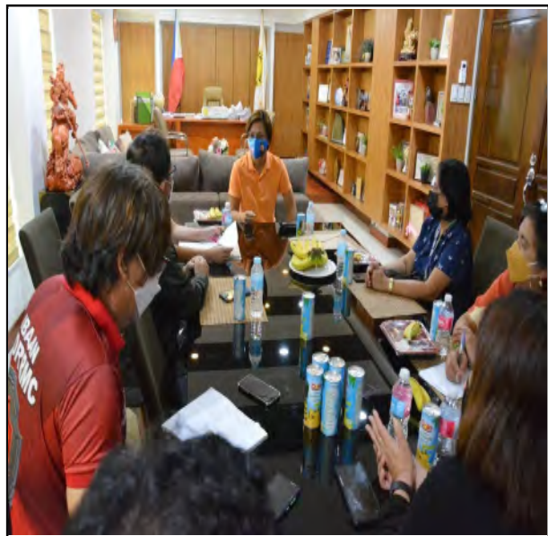
DENR Batangas, Batangas LGU paiingtingin ang pagpapatitulo sa Ibaan, Batangas---p.11

Matatandaang inihayag ni Pangulong Rodrigo Duterte automatic exempted ang mga pulis at militar sa Comelec gun ban.