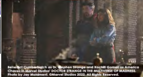
Benedict Cumberbatch as Dr. Stephen Strange and Xochitl Gomez as America Chavez in Marvel Studios' DOCTOR STRANGE IN THE MULTIVERSE OF MADNESS.