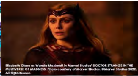
Elizabeth Olsen as Wanda Maximoff in Marvel Studios' DOCTOR STRANGE IN THE MULTIVERSE OF MADNESS.

Follow Marvel Studios Philippines on Facebook, Instagram, Twitter, and YouTube for the latest news and promos. Join the conversations online using #DoctorStrangePH.