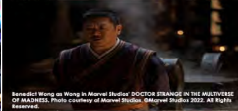
Benedict Wong as Wong in Marvel Studios' DOCTOR STRANGE IN THE MULTIVERSE OF MADNESS.