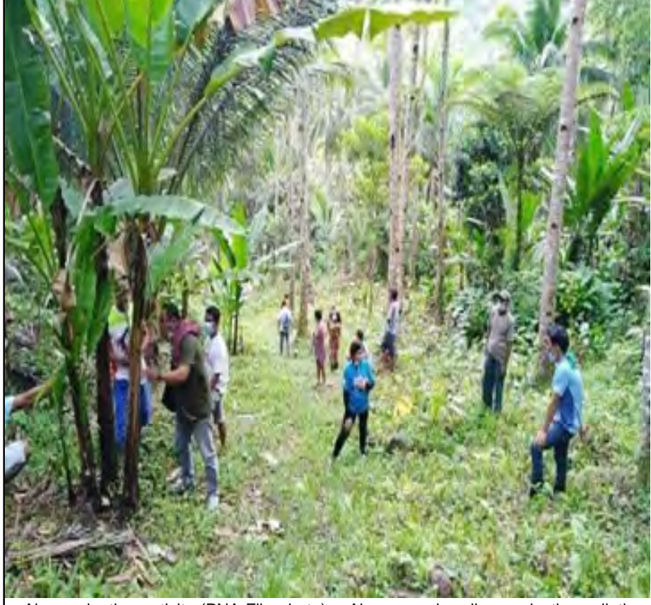
Abaca planting activity— Abaca can be ally vs. plastics pollution, deforestation (p.5)

Let's continue to observe #SafeMallingAtSM guidelines para #IngatAngat tayong