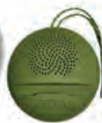
This ANCX Bluetooth Speaker with Phone Stand uses international advanced bluetooth chip and circuit design techniques that support all Bluetooth devices. With HIFI Speaker for a clear and bright sound quality.