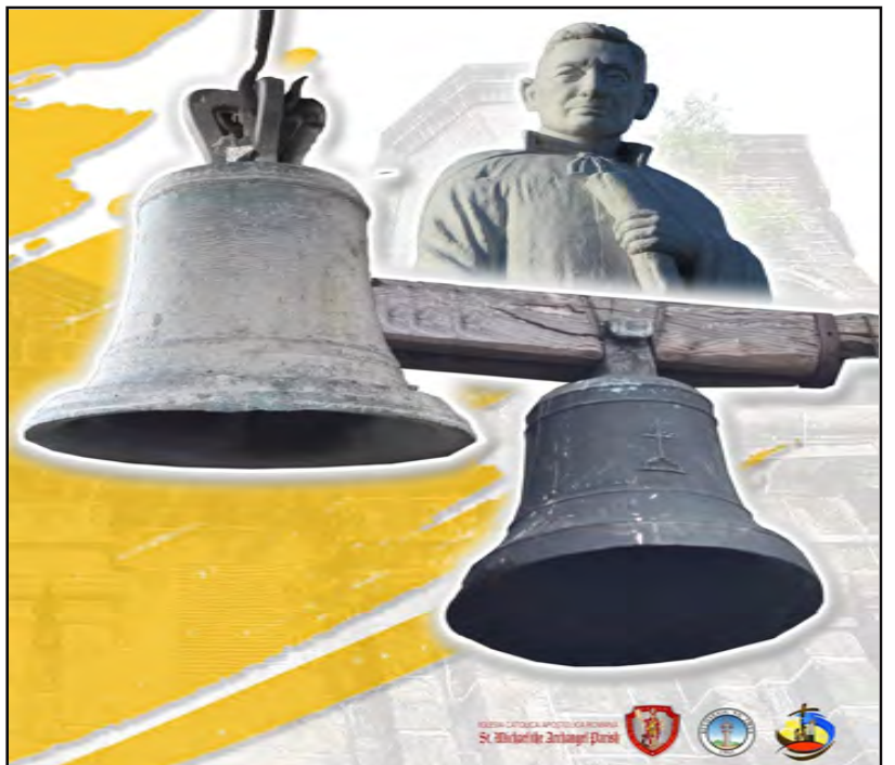
Martyrs' descendants undertake restoration of historic bells—p.11