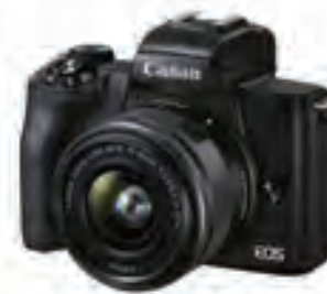
Canon M50 MKII 15-45MM KIT. Content creators, vloggers and your dad will find what they're looking for in this black Canon EOS M50 Mark II. A versatile multimedia camera with a well-rounded photo and video feature set.