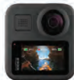
Go Pro Hero Max. Take panoramic photos and videos without actually panning your camera GoPro MAX 360 Action Camera. Using opposite side lenses, the MAX can capture everything that happens in a 360° view in high resolution video and still photos. The MAX supports multiple modes for creative video and photos – the PowerPan mode, which can take 270° still photos without distortion, and the TimeWarp mode which allows you to record in standard HERO mode with a variable speed function.