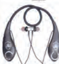
ANCX Gaming Earphones CA129. The gaming headphones earbuds produce top quality and clear sound giving a comfortable fit for a prolonged period. Bluetooth 5.0 and IPX5 water resistant – the latest Bluetooth version that offers a faster and more stable connection.