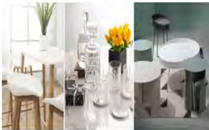
Hallie Bar Set in white and wood finish.