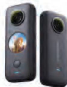
Insta360 X2 Pocket. The ONE X2 is Insta360's pocket-size spherical VR solution with dual and single-lens modes. Designed with 33° waterproof as is, without any waterproof housing required so you can take it underwater with you as well as use it in the rain.