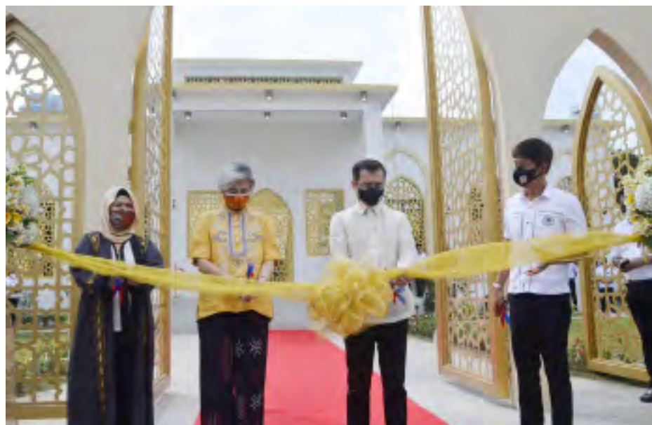
Pinangunahan nina Mayor Isko at Vice Mayor Lacuna ang pagpapasinaya sa kauna-unahang Muslim Islamic Cemetery at Cultural Hall sa lungsod sa Manila South Cemetery.