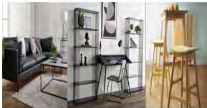
Lounge in style with this sleek and supple black leather Lexus Sofa.