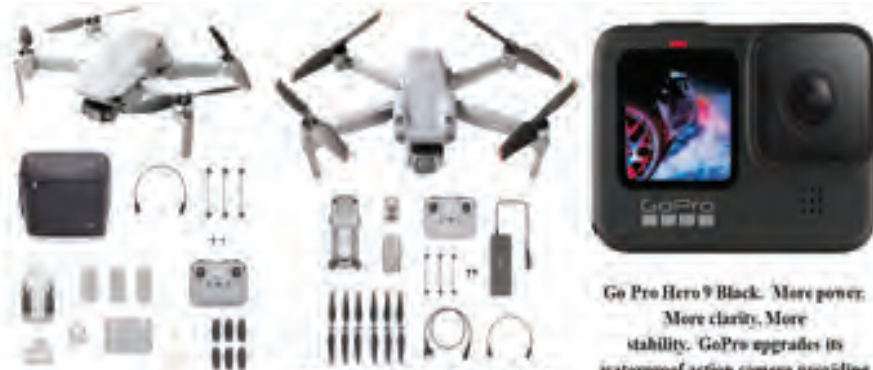
DJI Mavic Air 2S Fly More Combo. A drone for Dad. This Fly More Combo includes Charging Hub, a shoulder bag, an ND Filter Set, three intelligent flight batteries, and other practical accessories, allowing you to travel with fewer limitations and more creativity.