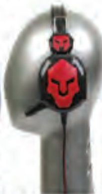
This ANCX Gaming Headphones gives a surround sound and full coverage earmuffs. With USB and 3.5mm connector.