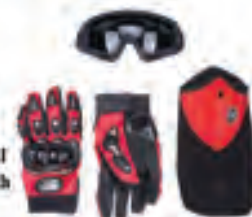
This ANCX Men's 3-in-1 Motorcycle Set includes gloves, mask and eyewear for motorcycle and bicycle rides.

Give Dad a gift of creativity, cool, and adventure with hot gadgets from The SM Store. Better still, shop from your home, and have them delivered to him on Father's Day through The SM Store's Call to Deliver service. Surprise him with light and compact drones for aerial videos, waterproof action cameras for vlogging and live streaming, and innovative multimedia cameras. He'll be on top of his game with gaming gear, and moto sets. Order from the comforts of your home and we will shop for you. Chat with us now via The SM Store's Facebook Messenger bit.ly/CTD-Messenger and Viber comm: bit.ly/JoinSMViber Viber admin: thesmstore.hiallie.com . Call #143SM (#14376) and talk to a personal shopper to enjoy a more personalized shopping experience. Visit thesmstore.com for more Father's Day gift ideas. ** The availability of items varies per store.