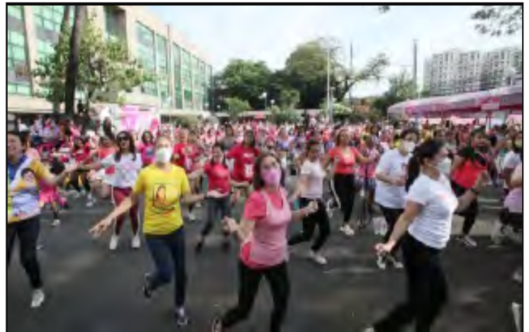
Women in early menopause at risk of non-fatal heart disease---p.5

ACCEPTING ADS, PLEASE CALL: 0977-7844136/ 0968-7122927