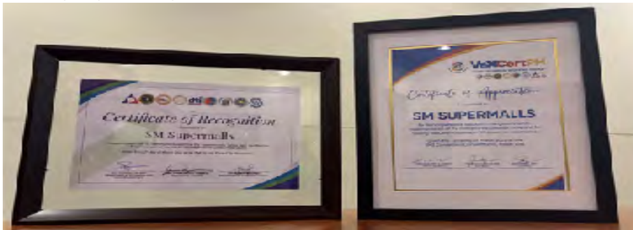
SM Supermalls awarded with Certificates of Recognition by the DILG, DOH, DTI, and DICT for their vaccination efforts

"Salute to all the recipients of this day's awards for your robust commitment and partnership with the national government as we altogether implement these programs down to the grassroots. I know and acknowledge that without your support, we would have not surmounted the past two years of this pandemic. Kaya nais kong ipaabot sa inyo ang aking taos-pusong pasasalamat," President Duterte said.