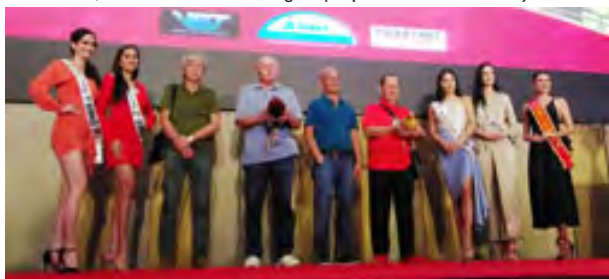
WORLD SLASHER CUP 2022

Ang WSC 2022 ay suportado ng Thunderbird, Emperador, Petron, Asiadwide Negrense Construction Corporation, Tempo, at Pilipino Mirror. Sa mga nais na masaksihan nang live ang nasabing derby sa Smart Araneta Coliseum ay maaari po silang bumili ng ticket sa Ticketnet o di kaya sa www.worldslasherup.ph