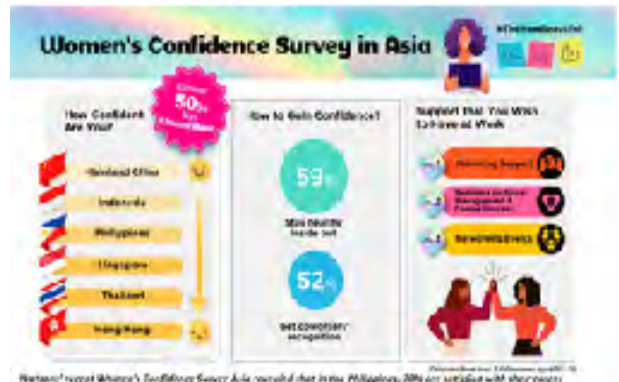
Watsons' recent Women's Confidence Survey in Asia revealed that in the Philippines, 70% are satisfied with their career progression and almost all believe it's possible to excel in their career.