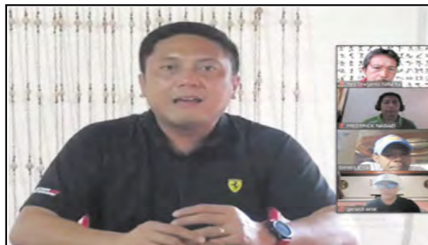
GUMACA QUEZON MAYOR

Si Gumaca, Quezon Mayor sa kanyang mga pahayag patungkol sa pagiging prioreddad nito sa kanyang nasasakupang lalawigan ang sports grassroots development ng humarap ito sa lingguhang TOPS usapang sports via zoom. (RGN)