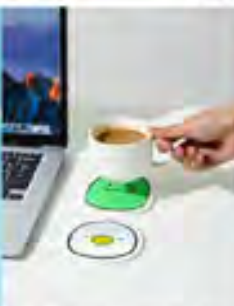
Coffee Time with cute Minisau and Pengen of the MINI Family Series.