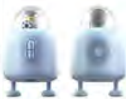
Miniso x MINI Family Sports Wireless Speaker with Night Light