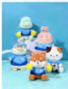
The MINI Family Sports Series brings active fun to Miniso PH stores.