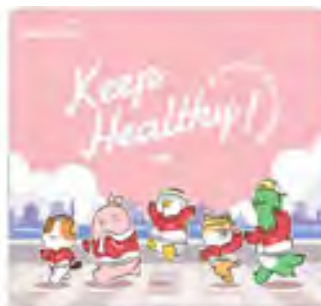
Get fit-spired with this MINI Family Sports Team Red Fitness Desk Pad.