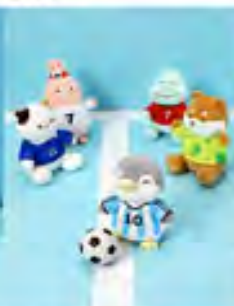
Surprise someone with Miniso's MINI Family Sports Blind Bag Collection