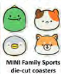
MINISO x MINI Family Sports die-cut coasters

Japanese lifestyle retailer Miniso brings sporting fun and cuteness to your home and office with its new MINI Family Series.