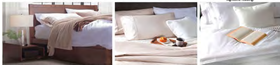
Your bedroom can speak to your personal aesthetic with Our Home's collection of beddings and pillow, and other bedroom accessories like this Tonya Table Lamp that creates a cozy ambience in your bedroom. Enjoy your morning coffee in Our Home's luxurious bedding collection. Create your own hotel bedroom suite at home with white sheets from Our Home's Hotel Living Duvet Set with 700-thread count.