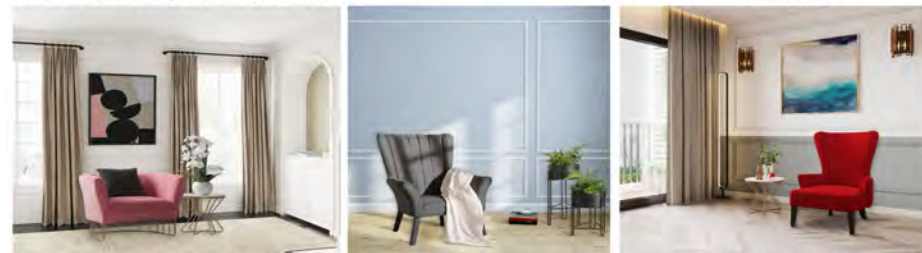
Relax and unwind in this Jetson Accent Chair with tufted backrest and metal wire legs in gold. Scandinavian inspired hi-back Adriana Accent Chair. Create a special corner in your room with Our Home's Amanda Accent Chair in rich velvet fabric and Peresia side table with marble top and gold metal base.

Most of us design our bedrooms with a good night's sleep and relaxation in mind. That's why we have stocked up on soothing essentials – soft sheets, cozy comforters, pretty throw pillows, and cuddly blankets.