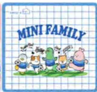
Be a champ like the MINI Family Sports Team Blue.