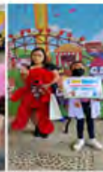
A kid bravely holds her "I am Brave" sign after being inoculated with Pfizer vaccine for kids as her Mom looks on.