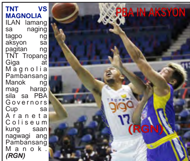
TNT VS MAGNOLIA