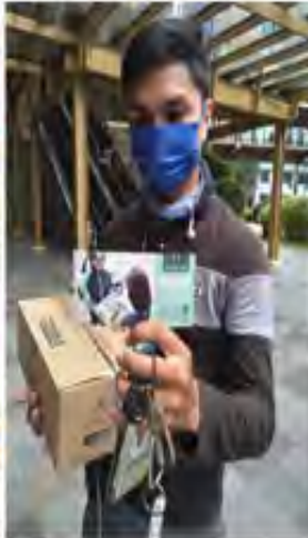
Grab riders received the love from The Body Shop purchase you made via Call to Deliver over the holidays.

hospitals. Hospital partners include QC General Hospital, VRP Medical Center, The Medical City Pasig, San Juan De Dios Hospital, Las Pinas City Medical Center, Inc., Commonwealth Hospital and Medical Center, University of Sto. Tomas Hospital, Manila Doctors Hospital, Mission Hospital, Our Lady of Lourdes Hospital, Marikina Doctors Hospital and Medical Center Inc., The Premier Medical Center, South Super Highway Medical Center, and Medical Center Paranaque. Customers also shared the joy with 700 Grab riders through The Body Shop Call to Deliver orders made over the holidays. Through this, Grab riders received a Goldilocks Bitbit pack from The Body Shop. The Body Shop continues to spread the love in the New Year. Look Good, Feel Good and Do Good. Visit and shop at The Body Shop store, on its online store www.thebodyshop.com.ph or via Call to Deliver 0917.1800259.