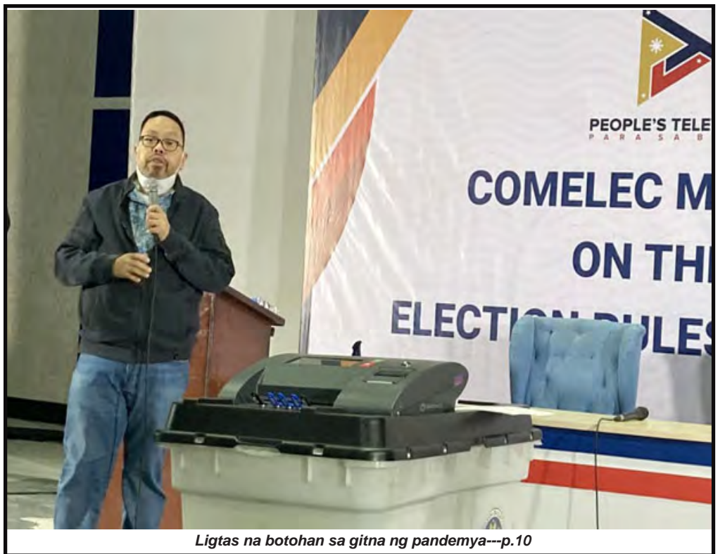
Ligtas na botohan sa gitna ng pandemya---p.10

ACCEPTING ADS, PLEASE CALL: 0977-7844136/ 0968-7122927