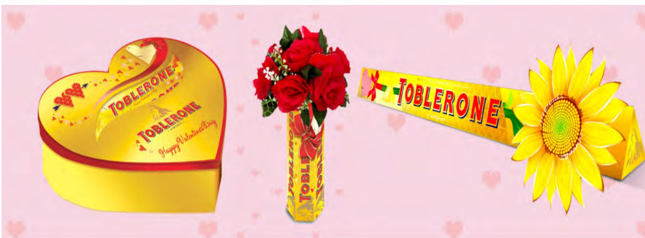
Say it sweetly with this Toblerone Heart-shaped box.