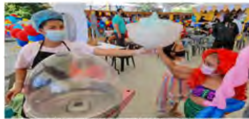
Pretty girl dressed as Ariel from the Little Mermaid receives her free cotton candy as a reward for getting her COVID-19 vaccine.