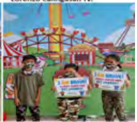
Kids in camo outfits shout out "I am Brave" at Resbakuna Kids, a pediatric immunization program of the government held at Skyranch Tagaytay.