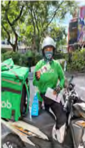
700 Grab Riders felt your love over the holidays as they received their Goldilocks Bitbit Pack from The Body Shop Call to Deliver orders.