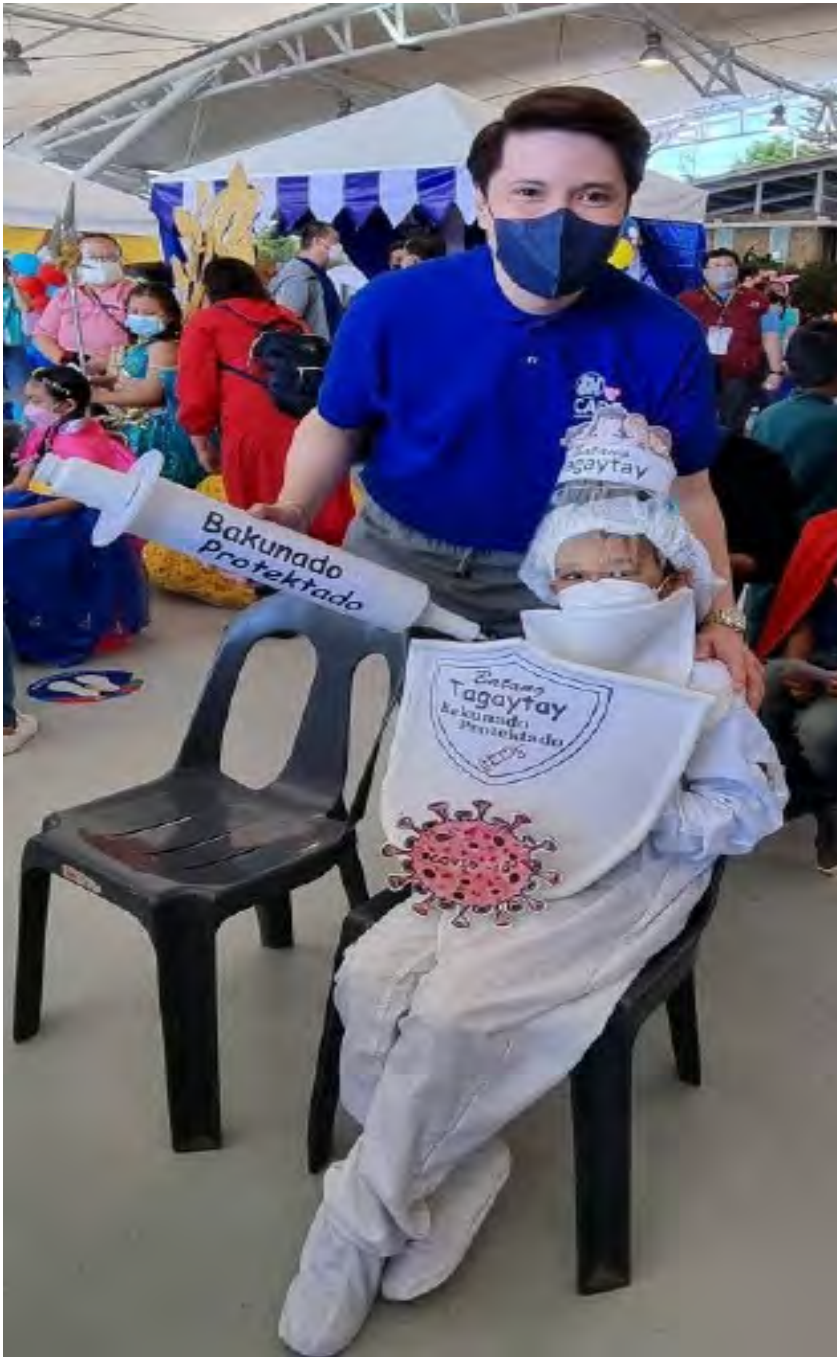
Posing after the shot, the child campaigned for other children to be protected through vaccines.

Vaccinations in the country for children age 5-11 year started early February in preparation of the resumption of the face to face classes.