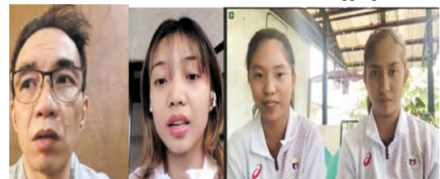
TABLE TENNIS - TOPS GUESTS

Para mas mahasa, ipinahayag ni Ledesma na inimitahan nila ang dalawang high-ranke player ng India at coach ng Pakistan para samahan sila sa 'bubble' training mula Marso 1 hanggang Abril 30.