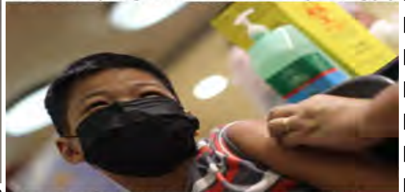
A smile after the shot, this brave kid is glad to have his vaccine at SM City Bacoor.