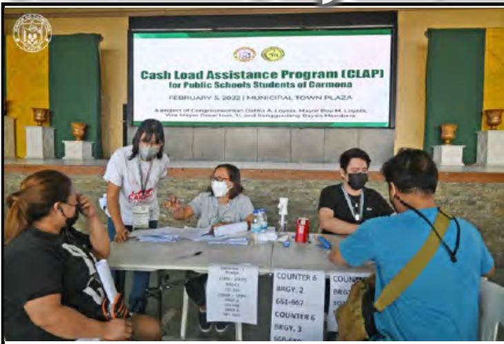
Cash Load Assistance Program gives additional student aid---p.12