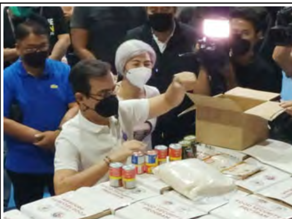
Personal na ininspeksyon ni Mayor Francisco Isko Moreno Domagoso ang mga food boxes bago ang pamamahagi sa mga residente ng Maynila kamakailan. Ito ay nasa 700,000 food boxes at bawat kahon ay may lamang tatlong bigas, 16 delata at anim na kape. Ang pamamahagi ng food security program boxes ay kasunod ng pagsisikap ng lokal na pamahalaan ng Maynila para maiwasan ang hawaan ng COVID-19 at ibang variant nito sa bawat Manilenos.

Distributions were held in two separate venues: the Municipal Town Plaza for Barangays 1 – 7 claimants while Carmona Elementary School accommodated