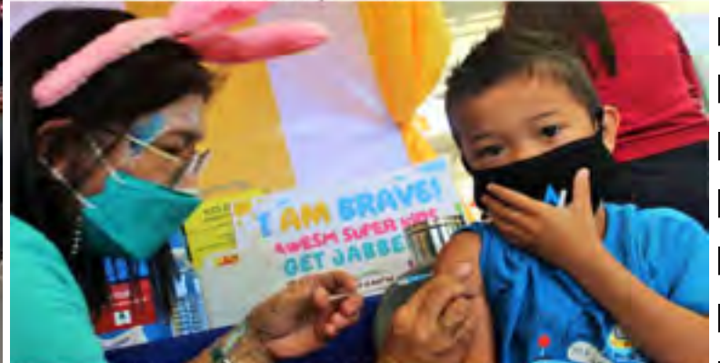
The brave little boy taking his Covid-19 vaccine shot at Skyranch, Tagaytay.