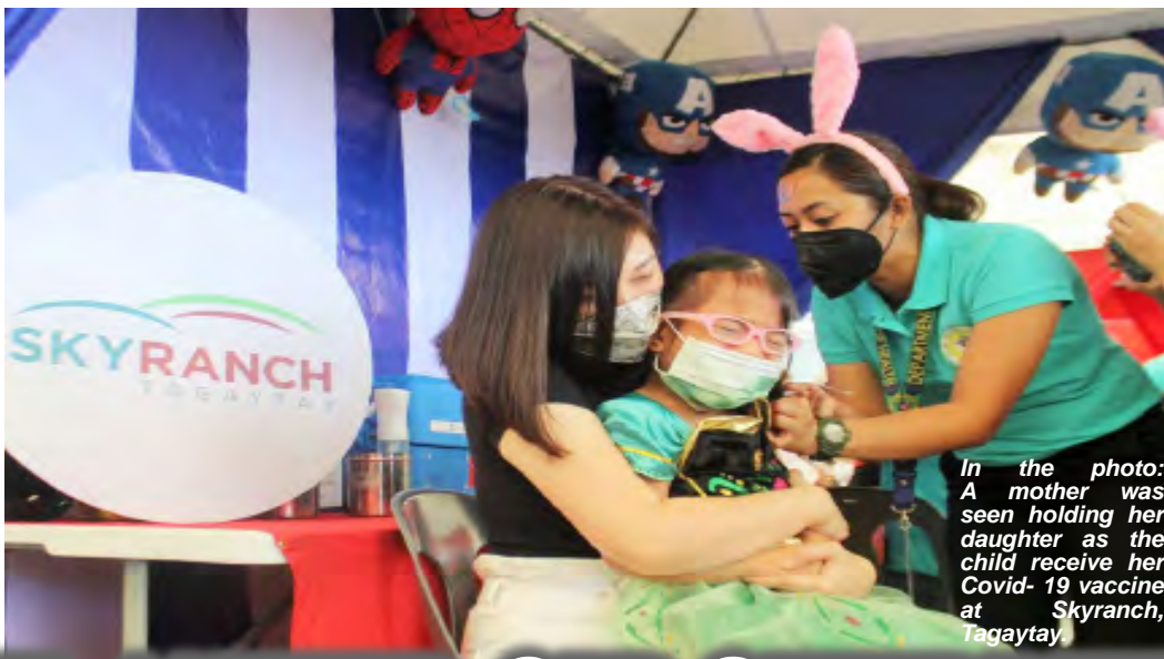
In the photo: A mother was seen holding her daughter as the child receive her Covid-19 vaccine at Skyranch, Tagaytay.