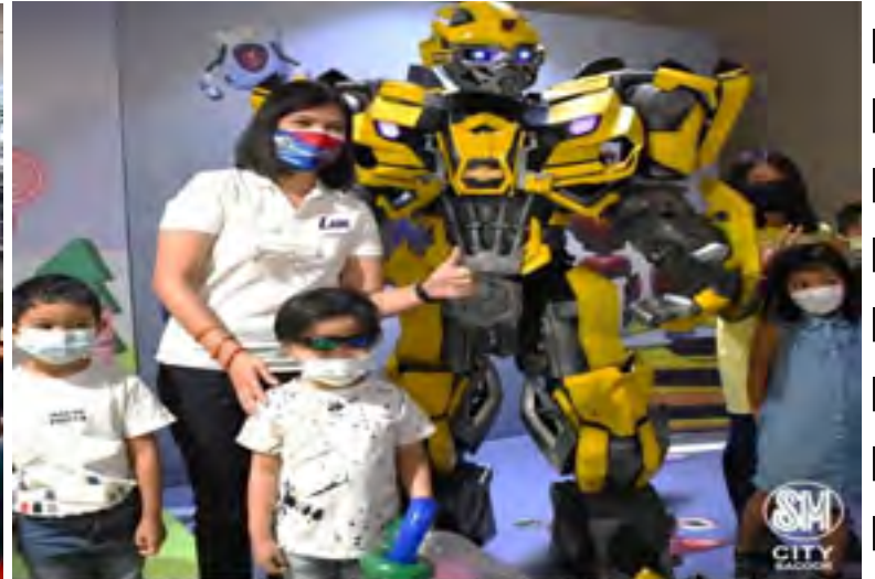
Mayor Lani Mercado – Revilla posing with the children and Bumble Bee after their vaccination at SM City Bacoor