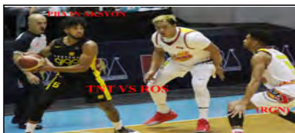
TNT VS ROS

MAGIGING umaatikabong aksyon muli sa hanay ng PBA Governors Cup ngayong Pebrero 16 sa Araneta Coliseum kung saan ang nasa talaan para sa makakaharap ng TNT Tropang Giga ay San Miguel Beer habang haharapin naman ng Rain or Shine Elasto Paint ang Alaska Aces sa Pebrero 17. (RGN)