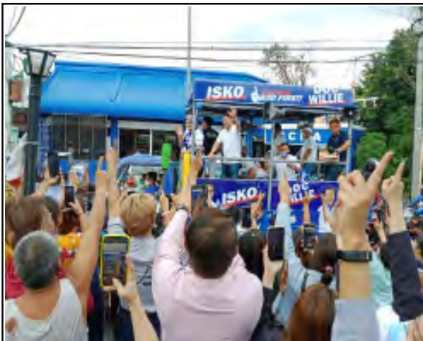
NAG-IKOT sa Maynila si presidential aspirant Francisco "ISKO" Domagoso kasama ang kanyang vice president aspirant na si Doc Willie Ong sa pagsisimula ng campaign period para sa national positions nitong Pebrero 8. Naging mainit ang pagsalubong sa kanila ng mga Manilenyo.

St., Ermita, Manila 1002. Publisher Association of the Phils., Inc. (PAPI) is one of the media partner.