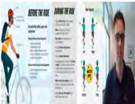
The Biker's Manual provides useful information on gearing up for safety before each ride. The manual contains handy information on bike signals, road safety tips, and guidelines based on the Active Transport Guidelines of the DOTr. Embassy of the Netherlands Deputy Ambassador Pieter Terpstra attends the virtual launch of the bike manual.

The Bike-Friendly SM initiative is SM Cares' community-based advocacy to support inclusive and safe mobility and promote a culture of cycling. The project is part of a comprehensive plan to make communities where SM malls are located, more inclusive, livable, and sustainable.