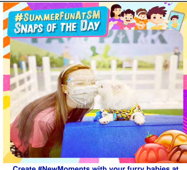
Create #NewMoments with your furry babies at SM City Dasmariñas indoor Paw Park Calling all Petparents and Furbabies to come, sit and play at SM City Dasmariñas Paw Park! Keep your dogs active and test their agility in different obstacles. Create #NewMoments and take them on a fun day-out from 10AM to 9PM daily.