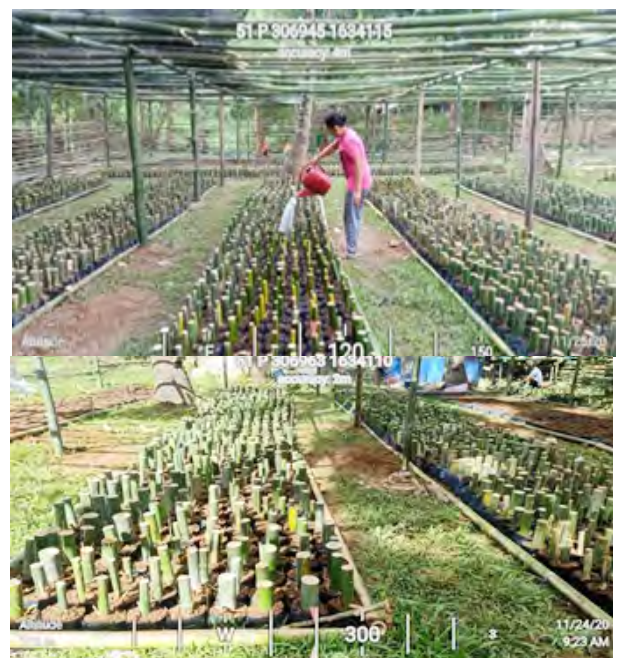
Bamboo Planting Material Production

Pakikipag ugnayan sa People's Organization ukol sa implementasyon ng stream bank stabilization sa UMRBPL