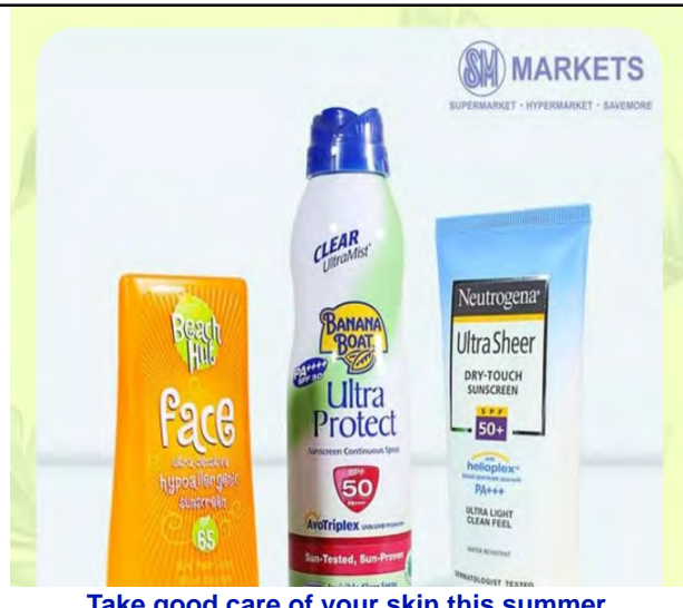
Take good care of your skin this summer Do you know that sunblocks form a shield to block UV rays while sunscreens have components that absorb the rays before your skin does? Pick your defense from the range of sun protection with SPF levels starting at 15 and up at SM Hypermarket SM Marketmall. Visit them daily from 8AM to 8PM!