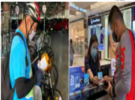
A bike rider at SM City Marikina goes through the Biker's Manual. A bike rider at SM City Marikina gets a copy of the DOTr-SM Bike Manual at the mall's customer service counter. Bike riders and those interested to take up biking can get a copy for free at the mall's customer service counter or from guards assigned at the mall bike parking areas.