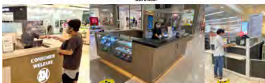
The Consumer Welfare Desk located at the SM Supermalls are accepting payment for SSS and Pag-ibig contributions as a side service for customer's convenience. Prepaid cards and e-loads are also available here. The SM Mall's Information Booths are also some of Servicio's offsite locations where one can buy prepaid cards and e-loads. Servicio's bills payment service and other products such as prepaid cards and e-load are also available at the SM Supermarket, SM Hypermarket and Save More.

SM's Servicio, which was known as the SM Business Service Center, is one of the largest and most extensive over the counter one-stop shops for bills payments, foreign exchange and remittances, government services, and more in the country.