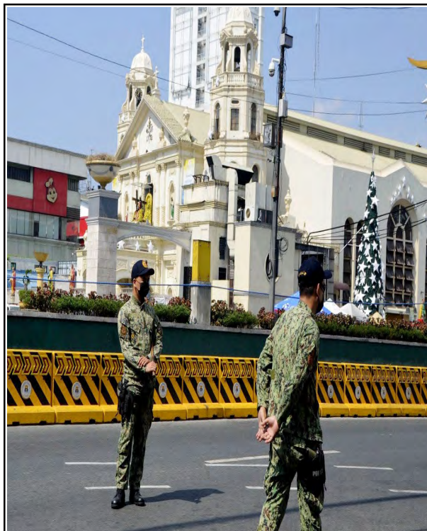
BUNGA ng mahigpit na pagbabantay ng kapulisan partikular ng Manila Police District at ng National Capital Region Police Office ay nagmistulang 'ghost town' ang paligid ng Quiapo, Maynila nitong katatapos na pista ng Itim na Nazareno dahil hindi pinahintulutan ang traslacion bilang pag-iingat sa COVID-19 lalo na ang umaataakeng variant na omicron.