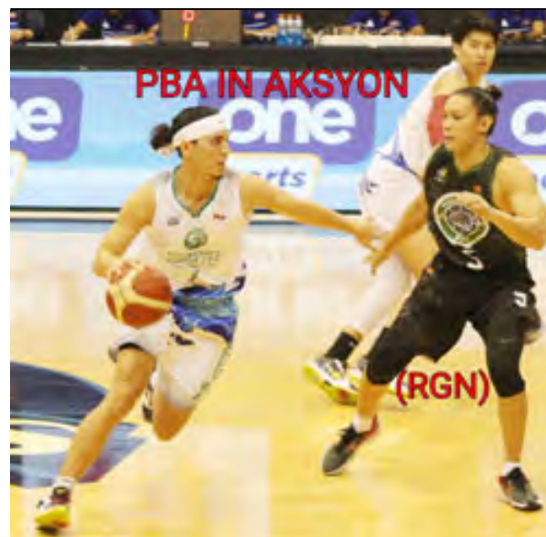
PBA IN AKSYON