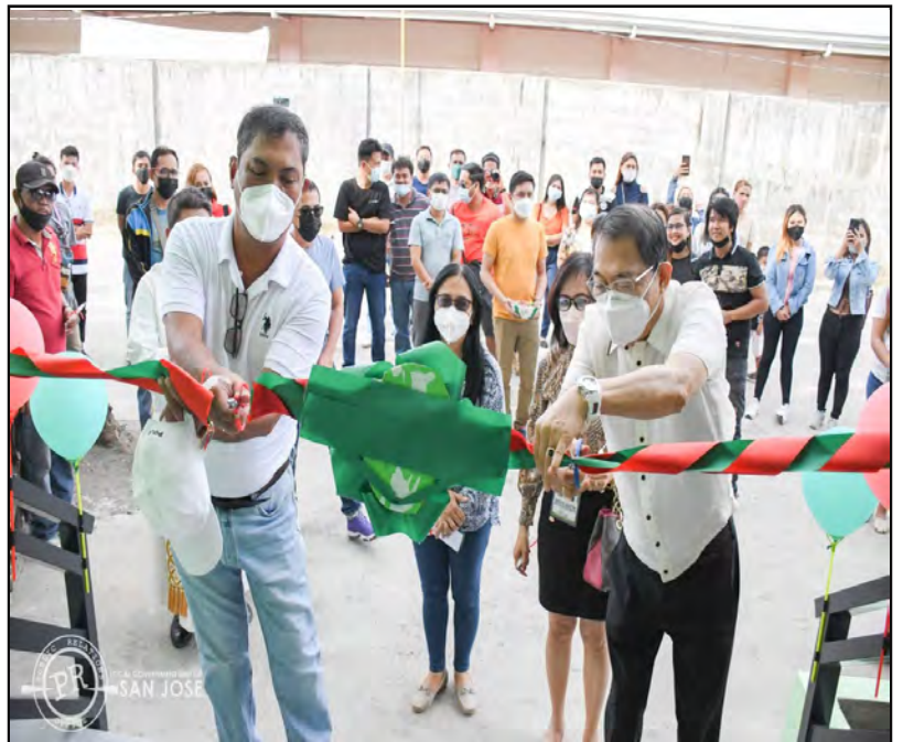
15M multi-purpose building sa San Jose, pinasinayaan---p.11

Per DTI FAIR TRADE Permit No. FTEB-133966, Series of 2021