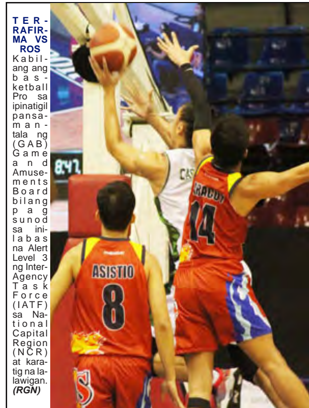
TERRAFIRMA VS ROS Kabilang ang basketball Pro sa ipinatigil pansamantalang (GAB) Game and Amusements Board bilang pag sunod sa inilabas na Alert Level 3 ng Inter-Agency Task Force (IATF) sa National Capital Region (NCR) at karatig na lalawigan.