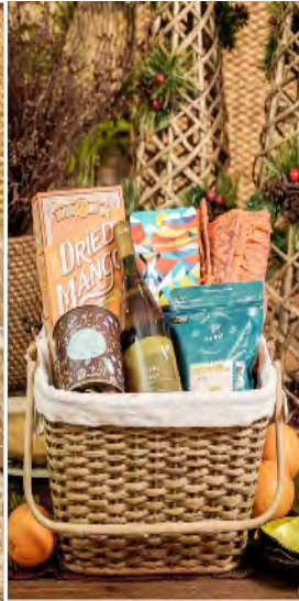
Regalo for the Pinoy Foodie: Make your own Christmas hamper and send it out to your loved ones for Christmas. Fill your basket with Kultura's selection of Philippines' best from dried mangoes, hot chocolate mix, local coffee, wine and premium chocolate.

The Philippines is very rich in the gift giving tradition. Filipinos love to give gifts because of their warm nature, and consider this an expression of love. Giving a gift to someone we care about allows us to communicate our feelings and appreciation for them.