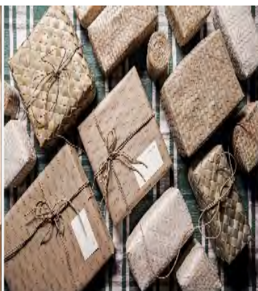
Gifts all-local this year? Go with native gift packaging to match! Kultura's sinamay bags and wrappers, pandan boxes, and raffia ribbons will give your presents the perfect proudly Filipino finishing touch.