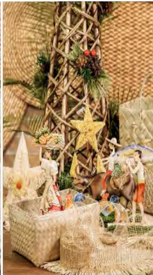
Handmade tin decor depicting idyllic rural scenes are a charming antidote to homesickness. Wrapped up in pandan boxes, they'll make lovely gifts for yourself or loved ones near or far this Christmas!