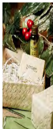
Curate your own CocoBody gift sets. These natural virgin coconut oil products soothe, moisturize, cleanse, and heal from head to toe will pamper you and your loved ones this Christmas.