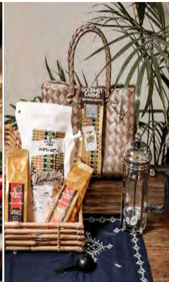
Regalo para sa Coffee Lover. Coffee sampler set from Gourmet Farms featuring premium beans from around the Philippines. The set includes Baraco Batangas coffee, Maynila Blend, Apo Coffee from Davao, and a lovely French press, encased in a reusable plastic bayong.