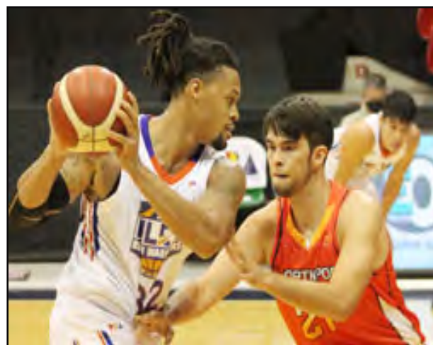
ANG ilan sa maaksyong tagpo sa pagitang ng NLEX at Northport sa paghaharap nila kamakailan sa 2021 PBA Governors' Cup (RGN)

Nahihiya lang si Moore na magtriple-double sa kanyang PBA debut na may 15 markers, 14 boards, at may isang steal at isang block, ngunit nakagawa rin siya ng limang error sa kabuuan.