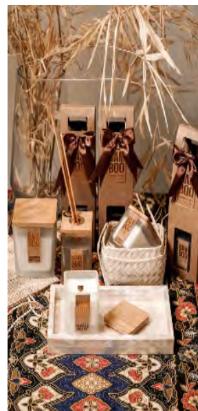
Bamboo's lovely line of scented candles and reed diffusers will transform any space into a calming sanctuary. Each Bamboo product is beautifully packaged and ready to gift.