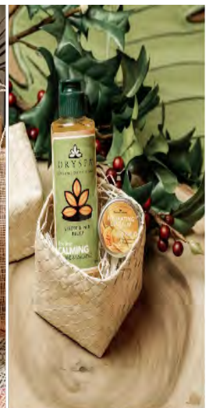
Treat yourself and your loved ones this Christmas with the wondrous health benefits of rice bran with Oryspa's gift sets from Kultura.