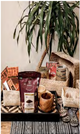
Regalo para sa Chocoholics. Choose from Kultura's world class artisanal chocolates beautifully packaged bars in interesting flavors for adventurous tastes, made with (low-glycemic!) coco sugar for the health-conscious, or even award-winning premium chocolate for the most refined palates. Can't decide? The hot chocolate and mug sets are always a hit!

SM CENTER IMUS, CAVITE – Holiday shopping? Last minute? Please be guided with SM Center Imus' Holiday Schedule for you to grab everything you need within this schedule. Please do not forget to wear your masks and maintain social distance for everyone's safety. Enjoy shopping!