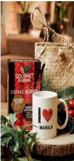
Gourmet Farms premium coffee blends and mug set.