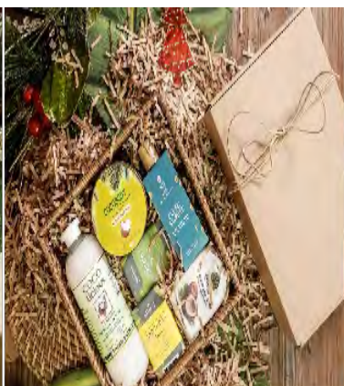
Curate your own gift box and give the gift of wellness while supporting local products.