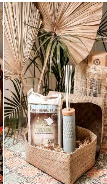
A Gift of Serenity. A gift set of a microwavable herbal pillow that soothes the mind and body and scented reed diffusers in a lovely ceramic package.