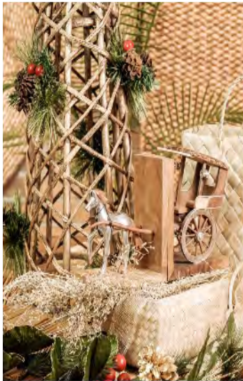
Kalesa bookends evoking the elegance of Old Manila are sustainably handmade from recycled aluminum and coco twigs. Shop now and get your orders delivered in time for the holidays! We ship here and abroad.