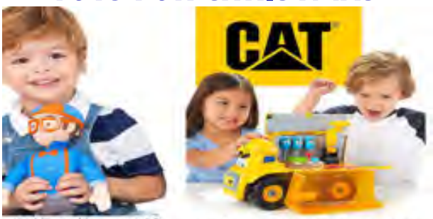
Cuddle and interact with pi My Buddy Blipp skills with CAT Junior Crew Fix-It Phillip