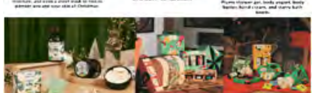
Spread the love this Christmas with The Body Shop's sustainable gift and packaging. They've designed most of their gift packaging to be reused or repurposed too, so your treats and surprises have a long life after Christmas.