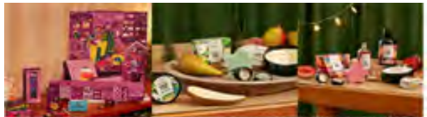
The Body Shop's new gift packaging is more sustainable than ever before. No plastic, bath and body accessories made with sustainable alternatives to plastic.