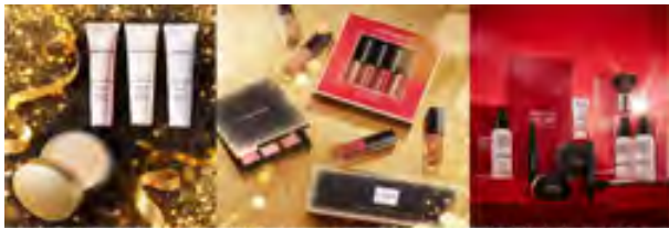
Luxe Merrier pure-essence primers and loose powder for a smooth and flawless coverage. Available at SM Beauty.

You can also enjoy an exciting but worry-free shopping experience with our online shopping platforms; shop with SM Beauty Personal Shoppers and discover more products when you check out the SM Catalog https://thesmstorecatalog.com/collections/beauty-and-health . You can also buy your beauty gifts through Shop SM, our Viber community, Messenger, and the SM Store's Call to Deliver service by calling #143SM or #14376.