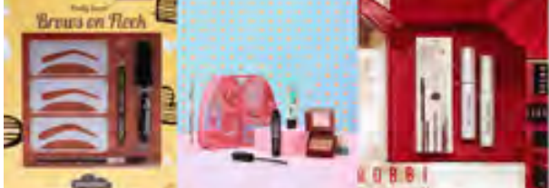
Brows on fleek with this eyebrow set from Pretty Secret.