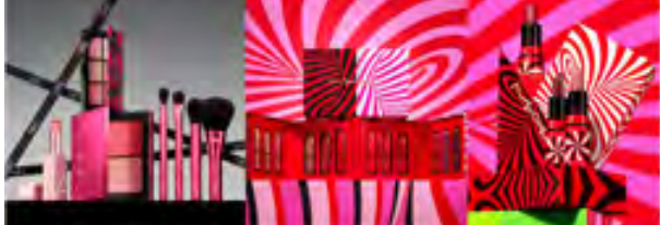
Gifts of beauty from Nars - organic blush duo, organic cheek-to-lip balm, mini eyeshadow palette, and make-up brush set.