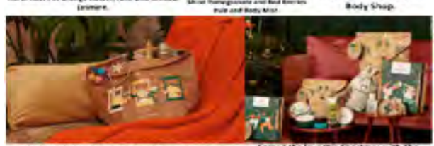
This Christmas, the Body Shop once again partners with Yellow Boat of Hope Foundation to support their Teach Anywhere Program. With every purchase our customer makes this Christmas, The Body Shop aims to donate to build Community Learning Hut and supplies to aid the children of Zamboanga Sibugay.