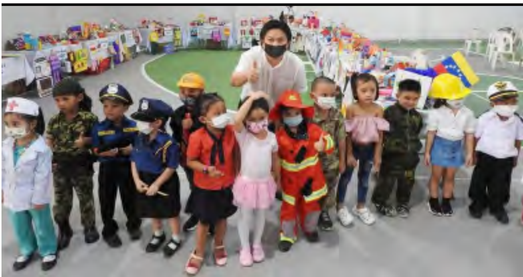
Children's Month presentation in Noveleta. - Local government of Noveleta led by reelectionist Mayor Dino Chua celebrates Children's Month at the newly built Noveleta Gymnasium in Barangay San Rafael 2, November 27, 2021. The Rural Health office conducted free dental check up for all kids to fight tooth decay, while the local chief executive delivers State of the Children Address.