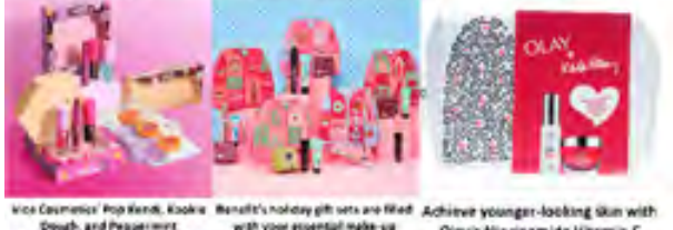
Vice Cosmetics Pop Kiehl, Kookie Dough, and Peppermint Collections with lip tint, lip balm, and lip oil. Available at SM Beauty.