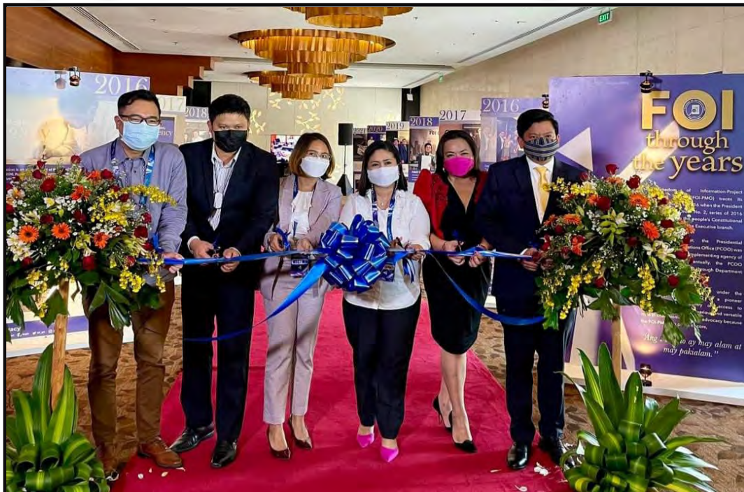
FOI REINVENTS THE FUTURE:CELEBRATES 5 YEARS OF IMPLEMENTATION--p.2

Get your season's cravings from Teriyaki Boy SM City Trece Martires Don't think. Just order. That's what you do when you crave. No stopping, no overthinking. Just say yes to #SeasonsCravings! Visit Teriyaki Boy at the Lower Ground Floor!