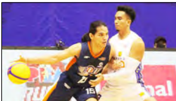
MERALCO VS TNT

Makikita sa larawan ang ilan sa maaksyong tagpo sa pagitan ng Meralco bolts at TNT Tropang Giga sa final match ng unang Leg sa PBA 3X3 Lakas ng Tatlo na ginanap sa Ynares Sports Arena Pasig City. Kung saan ay nanalo ang Tropang Giga sa Bolts. (RGN)