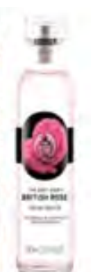
The sparkling scent of British Rose Eau de Toilette contains the essence of handpicked roses.