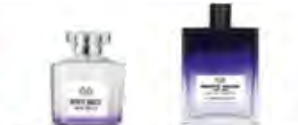
The iconic White Musk® fragrance collection for Women and Men will give that earthy and sensual notes for an ultra-smooth scent.