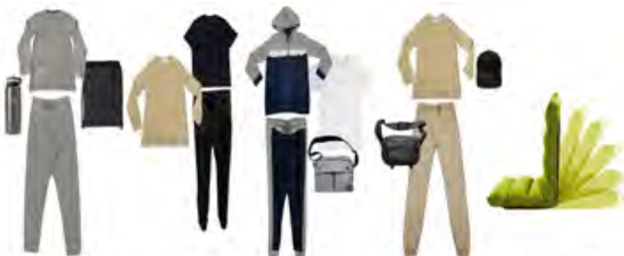
There's a lot of grey matter on the loungewear horizon. Upgrade your downtime with this khaki pullover and black coordinates. This hoodie and jogger pants combination will take you from lounging at home to Zoom meetings and beyond. Lounge in style with neutral tones. Comfortable, functional and adjustable Tatami Chairs are available in different colors.