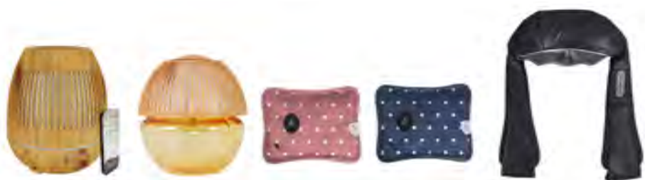
Get your much-needed pampering with this Wooden Aroma Humidifier and Wooden Air Revitalizer. Relax and ease your muscle pain with this Rechargeable Hot Compress. Treat yourself with some "me" time with this Rest Easy Massager.

Order To Deliver. Contact your nearest Surplus branch bit.ly/OTDcontacts Add to cart in Lazada: SurplusPH Flagship Store bit.ly/3qv9N1E #SMCallToDeliver. Visit https://thesmstorecatalog.com/surplus Stay updated as Surplus goes interactive. Like them on Facebook and Twitter at SurplusPH and enjoy great fashion deals on Instagram at Surplus_ph.