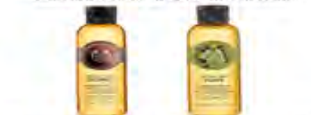
Keep your skin and hair silky soft, hydrated and intensely nourished with Coconut Flourishing Dry Oil and Olive Nourishing Dry Oil.

on five core values: Against Animal Testing, Support Community Fair Trade, Activate Self Esteem, Defend Human Rights and Protect The Planet.