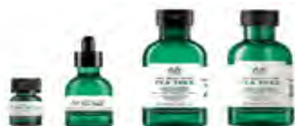
The Body Shop's Tea Tree range, which is perfect for oily and blemish-prone skin, is made with purifying Community Fair Trade tea tree oil from Kenya.