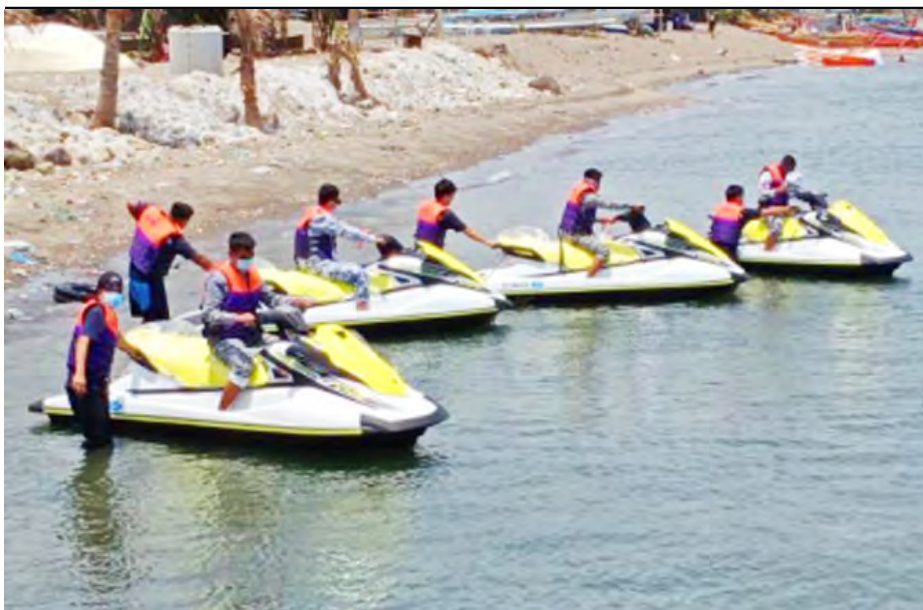
Cavite donates speedboat, jet skis to PCG.--- p.2