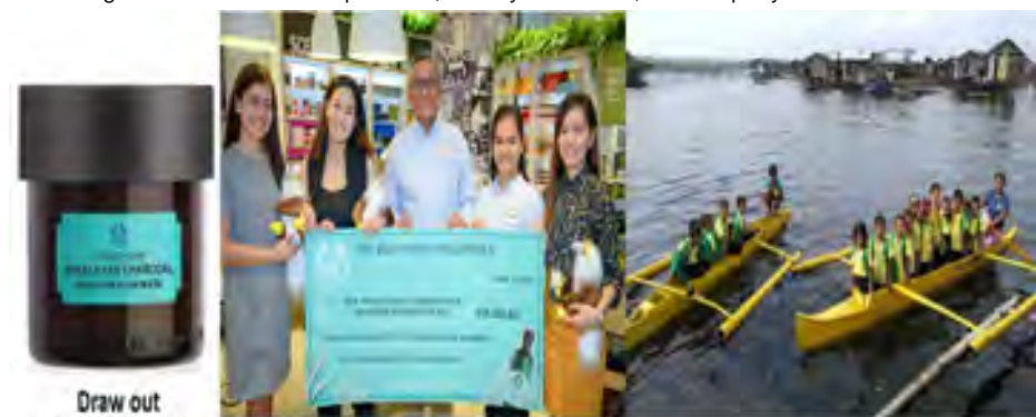
Draw out impurities and refine your pores with Himalayan Charcoal Purifying Glow Mask.

The Body Shop was founded in 1976 by Dame Anita Roddick in Little Hampton, England. The beauty brand pioneered corporate activism and was built on a philosophy that business can be a force for good. With its brand expression, Beauty with Heart, the company continues to be focused