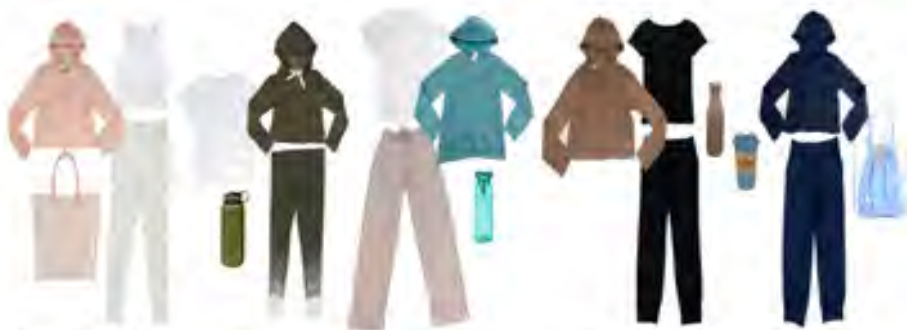
Energize your all-white ensemble with a pink hoodie and tote bag made of PVC material which is easy to disinfect after your outdoor errands. -Tie-dye leggings paired with a matching green hoodie. Hoodies are hot especially when worn with a pair of breezy linen pants. Elevate your loungewear with all-black outfit and a brown hoodie. Laid-back blues: blue hoodie and jogger pants.