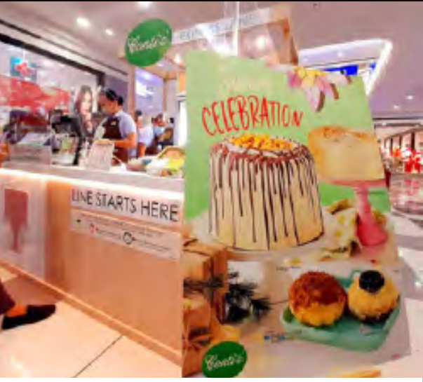
Conti's is now open at SM City Trece Martires Hey dessert buddies, get ready for a sweet overload as we give you the best and home favorite cakes and pastries at Conti's! Now open to serve you! Visit its store at the Lower Ground Floor!

Children below 18 years old may now enter SM Supermalls as long as they are accompanied by fully vaccinated guardians. Guardians must present their vaccination cards and valid ID upon entry. Make sure to always wear a face mask