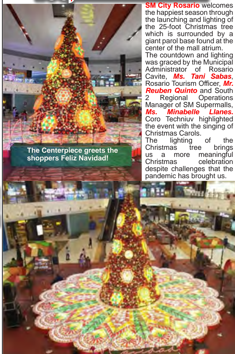
25-foot Christmas tree surrounded by a giant parol base sparkles at the center of the mall atrium of SM City Rosario.