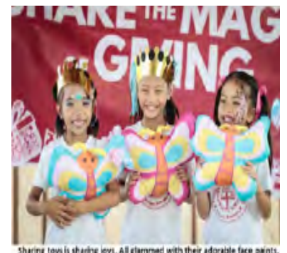
these girls happily display their pastel colored plush toys from The SM Sto during the Share A Toy campaign

SM shoppers can play Santa to less fortunate kids this Christmas in The SM Store and Toy Kingdom's Share a Toy project, from November 1 to December 31, 2021 Share a Toy booths with bag of toys, play sets, educational board games and novelty will be set up in all The SM Store and Toy Kingdom branches nationwide. Here, shop-pers will have the chance to bring and donate pre-loved or brand new toys that they can purchase from The SM Store's Toy Express and Toy King-