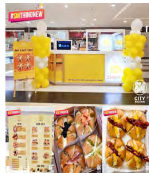
SM CITY BACOOR, CAVITE – Satisfy your Korean cravings with the famous Korean cheesy garlic bread from Chee-su – SM City Bacoor! Now you can grab these flavorful breads in solo packs and box of four for a different pasalubong that your family will surely love. Head now at the ground floor of SM City Bacoor and let these cheesy goodies burst to please your palate. See you Chee-su Chingu!