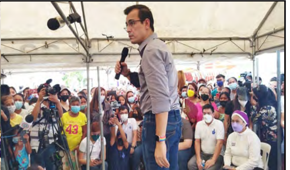
BAHAGI ito ng pagbisita ni presidential aspirant at Manila Mayor Francisco Isko Moreno Domagoso sa Bataan Provincial Capitol kamakailan. Nakipagdayalogo rin ang alkalde sa mga mangingisda sa bayan ng Balanga.

ACCEPTING ADS, PLEASE CALL: 0977-7844136/ 0968-7122927