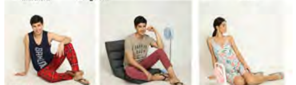
Chill at home with this cozy pajama and tank top from Surplus. Take it easy with Surplus' shirt and pajama set, comfy Japanese tatami chair and telescopic fan. Fun, feminine, and flowy lounge dress from Surplus.