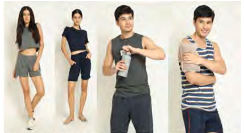
Hoodies are hot in the new Surplus loungewear collection, especially when worn with shorts Stay cozy with this dark blue monochromatic lounge set. Stay-at-home essentials: muscles tee + pajama and a stainless tumbler. A striped sando, easy shorts, and rechargeable hot compress to relieve your stress.

For a more convenient shopping experience, you may check out Surplus at Lazada, Shopee, SM Malls Online, and ShopSM. Surplus Order to Deliver is also now available; join their Viber community and follow them on Facebook and Instagram @SurplusPH and @Surplus_ph for more details.