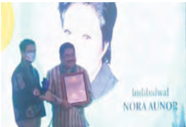
Kampeon ng Wika at Dangal ng Wika

KABILANG sa pinagkalooban ng parangal ang tanyag na sina Nora Aunor sa Kampeon ng Wika at Freddie Aguilar para sa Dangal ng Panitikan sa ginanap na parangal ng Komisyon sa Wikang Filipino (KWF) kamakailan sa pamamagitan ng online zoom. (RGN)