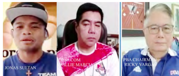
PSA FORUM ONLINE