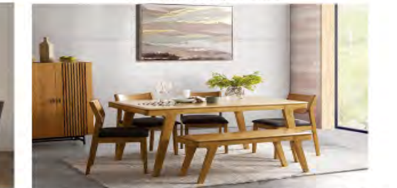
Make your dining experience fun and exciting with Our Home's Fredrik Dining Set with a rustic charm combining the casualness of a bench setting and the elegance of a dining chair.

With that, we are rethinking our dining rooms with the modern multifunctional table as the centerpiece. And the good news is that there is a lot of table talk from Our Home which also offers us some tips when selecting the dining table for your space.