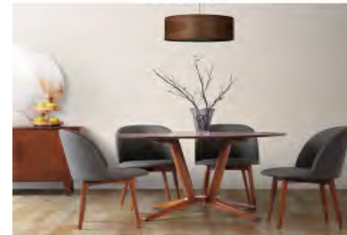
Dinner for four in a small dining space? Not a problem with Our Home's Ancona 4-seater dining set.