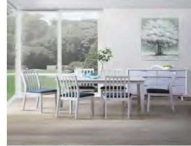
Create a light and welcoming ambiance to your dining room with this white Panfield 6-Seater Dining Set from Our Home.

The new-norm has redefined the importance and functionality of a dining table - transforming it into a WFH station, an online school stop where one does homework and art projects, and a hobby hub. That is, of course, apart from being a gastro address for home cooked specialties and the take-out favorites we have come to love.