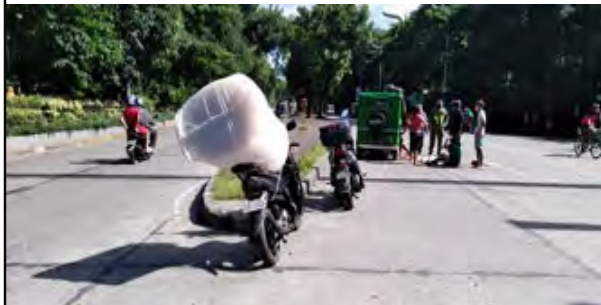
TUMAGILID ang green tricycle pagbaba galing ng Jones Bridge na ikinasugat ng apat na pasahero. Dalawang rider ang huminto upang tumulong gayundin ang mga driver ng tricycle at pedicab na nakapila roon. RS