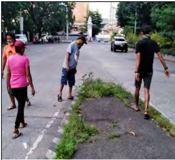
ANG mga tricycle at pedicab driver na tumulong sa aksidente ay tintingnan ang mga marka sa bangketa sa pagkakasadsad ng tricycle na tumao patagilid. RS