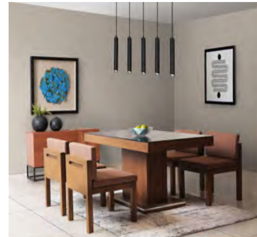
Great dining and great conversation starts in this Alvea 6 Seater Dining Set from Our Home.

**Only at Our Home. Great Designs. Great Prices.