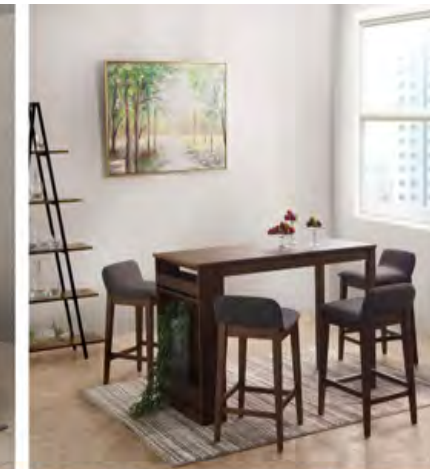
Here's something for those who prefer to keep things informal and relaxed. Our Home's Ethane Dining Set is a stylish bar table set that lends an air of casual comfort to any dining space, big or small.