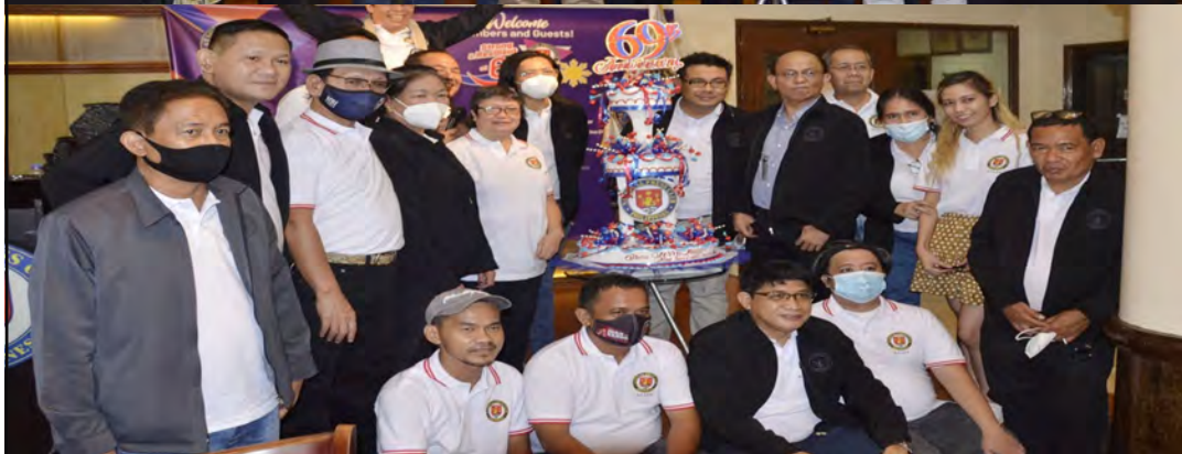
ANG SIMPLENG CELEBRATION NG 69TH FOUNDING ANNIVERSARY NG NATIONAL PRESS CLUB OF THE PHILIPPINES NA DINALUHAN NG MGA PILING PANAUHIN DAHIL SA PANDEMIC NA SITWASYON.