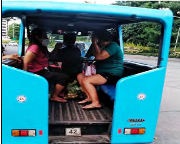
DAHIL sa matagal na pagdating ng ambulansiya ay ang service vehicle na lamang ng barangay sa lugar ang nagdala sa pagamutan sa mga biktima ng vehicular accident.