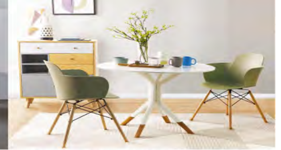
A breakfast for two with Our Home's Scandinavian-inspired foldable Jada Dining Table. Perfect for small spaces, pair it with a couple of Iona Dining Chairs for a great dining experience.