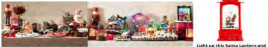
Create a holly, jolly Christmas dining table with cheery red and crimson berries. Whimsical and festive Nutcracker tabletop. Light up this Santa Lantern and add a festive glow in your home.