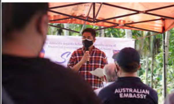
SECRETARY ANDANAR: SUPPORT THE GOVERNMENT IN ADDRESSING ENVIRONMENTAL CONCERNS---p.4