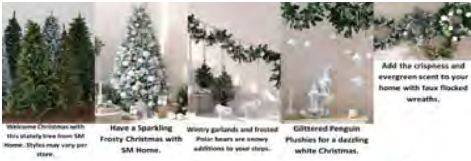
Welcome Christmas with this stately tree from SM Home. Styles may vary per store. Have a Sparkling Frosty Christmas with SM Home. Wintry garlands and frosted Polar bears are snowy additions to your steps. Glittered Penguin Plushies for a dazzling white Christmas. Add the crispness and evergreen scent to your home with faux flocked wreaths.