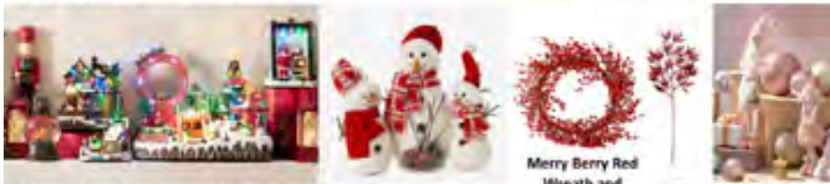
Showcase nostalgic scenes of Christmases past with Christmas Villages. Cheery snowman tabletops. Merry Berry Red Wreath and Glittered Leaf Spray fillers. Glam in Pink and Gold hues with these Pink Angel doll and Santa doll tabletops.