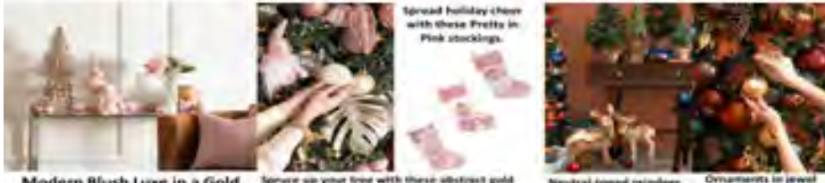
Modern Blush Luxe in a Gold and Pretty Pink palette. Spread holiday cheer with these Pretty in Pink stockings. Spruce up your tree with these abstract gold bunnies for elaborate pink ornaments like these Nordic Gonk dolls. Neutral-toned reindeer and burlap Christmas trees are perfect for a cozy country home. Ornaments in jewel tones, pine cones and sprig maple leaves for a rustic look.