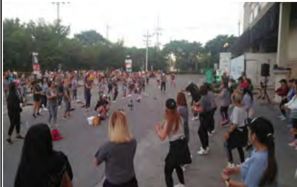
DAGSA ang mga nakilahok sa Zumba na ginanap sa Villar Sipag Cmpd., All Day Mall, Las Pinas City. Pinayagan ng ang zumba fitness subalit dapat manatili ang health protocol at social distancing. Ito ay ginagawa tuwing araw ng Sabado at Linggo ng umaga simula 6 am -8 am. (JIMMY P.HAO)