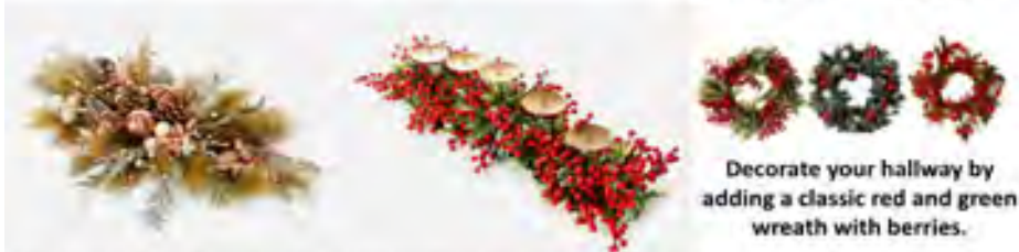
Copper and gold with pine cone centerpiece. Christmas centerpiece in traditional red and green ornaments. Decorate your hallway by adding a classic red and green wreath with berries.

When you think about Christmas, traditional colors of red, green, and gold come to mind. But with most of us spending more time at home, it's a good idea to be more creative when selecting holiday hues to add a contemporary touch to Christmas celebrations.