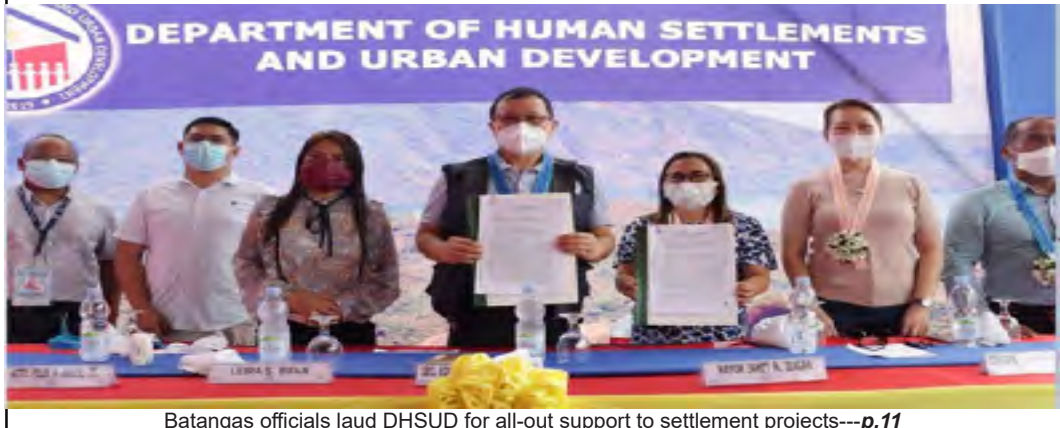
Batangas officials laud DHSUD for all-out support to settlement projects---p.11