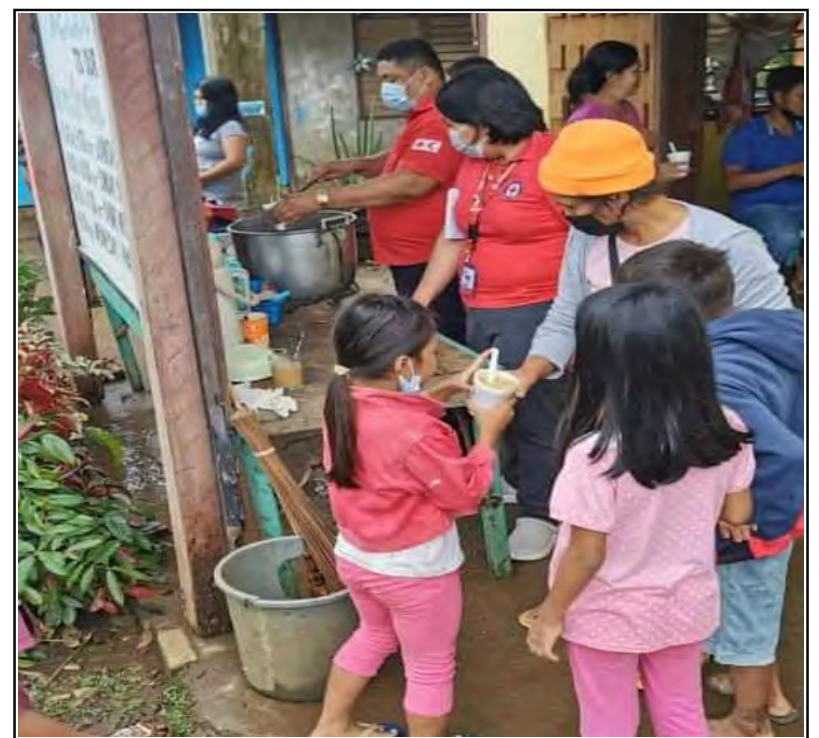
Red Cross deploys local chapter assets and personnel as STS 'Maring' rages on.---p.8

ACCEPTING ADS, PLEASE CALL: 0977-7844136/ 0968-7122927