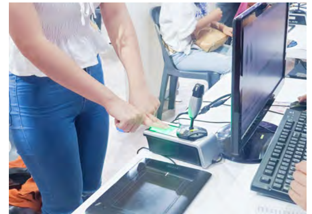
Biometrics is being done during the registration for the voter's identity.

SM City Dasmariñas and Commission on Elections (COMELEC) have officially teamed up to provide voters a convenient registration venue. This gives the people to have a safer and more convenient option amidst crisis on COVID-19. The registration started on September and it is now extended! Voter's Registration schedule at SM City Dasmariñas: October 11-15, 18-22 & 25-30. Visit SM City Dasmariñas Facebook page for details.